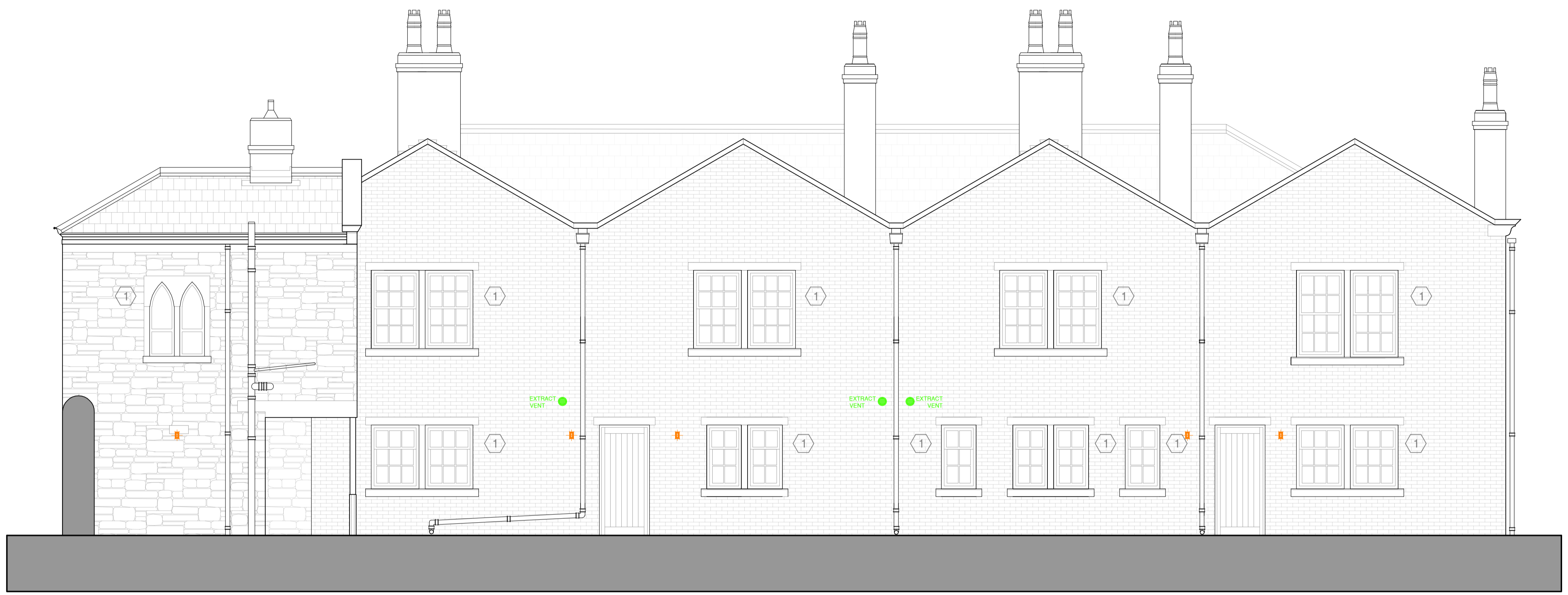
1 NORTH ELEVATION AS PROPOSED SCALE 1:50