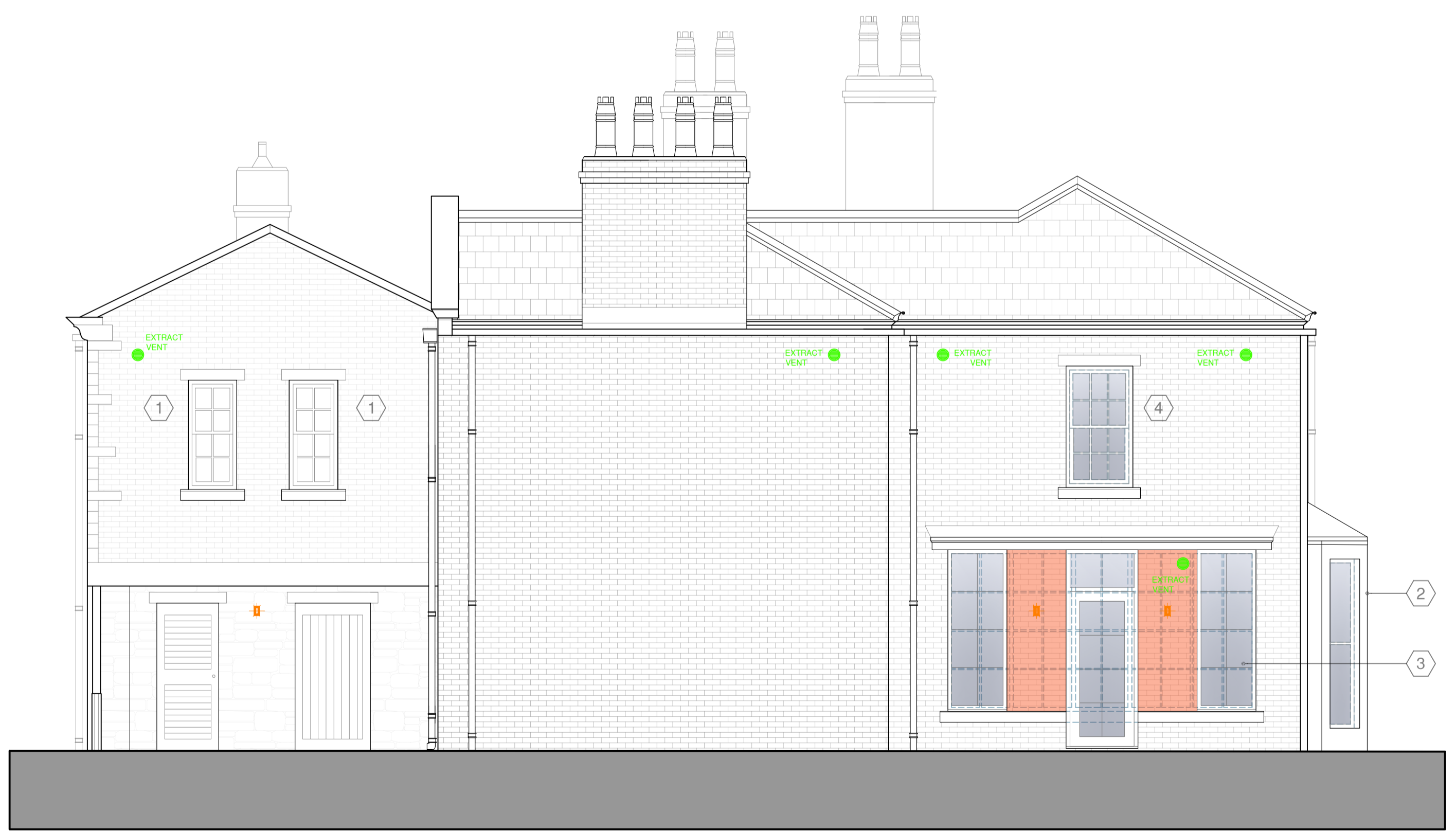
2 WEST ELEVATION AS PROPOSED SCALE 1:50