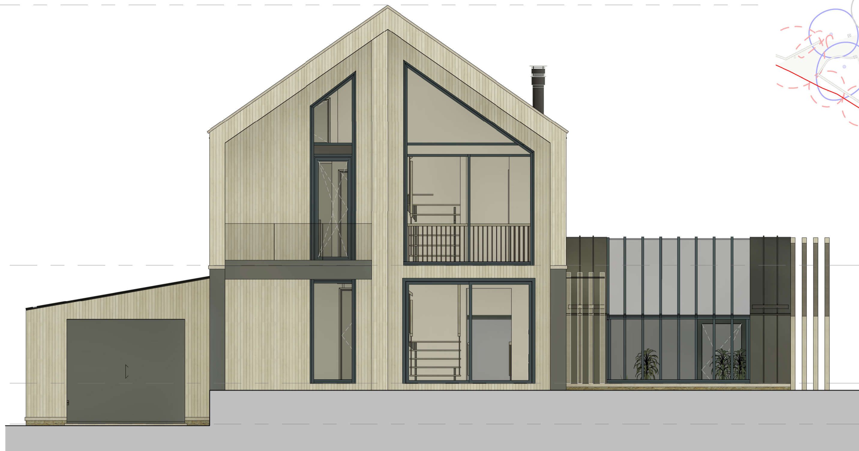
West Elevation - B