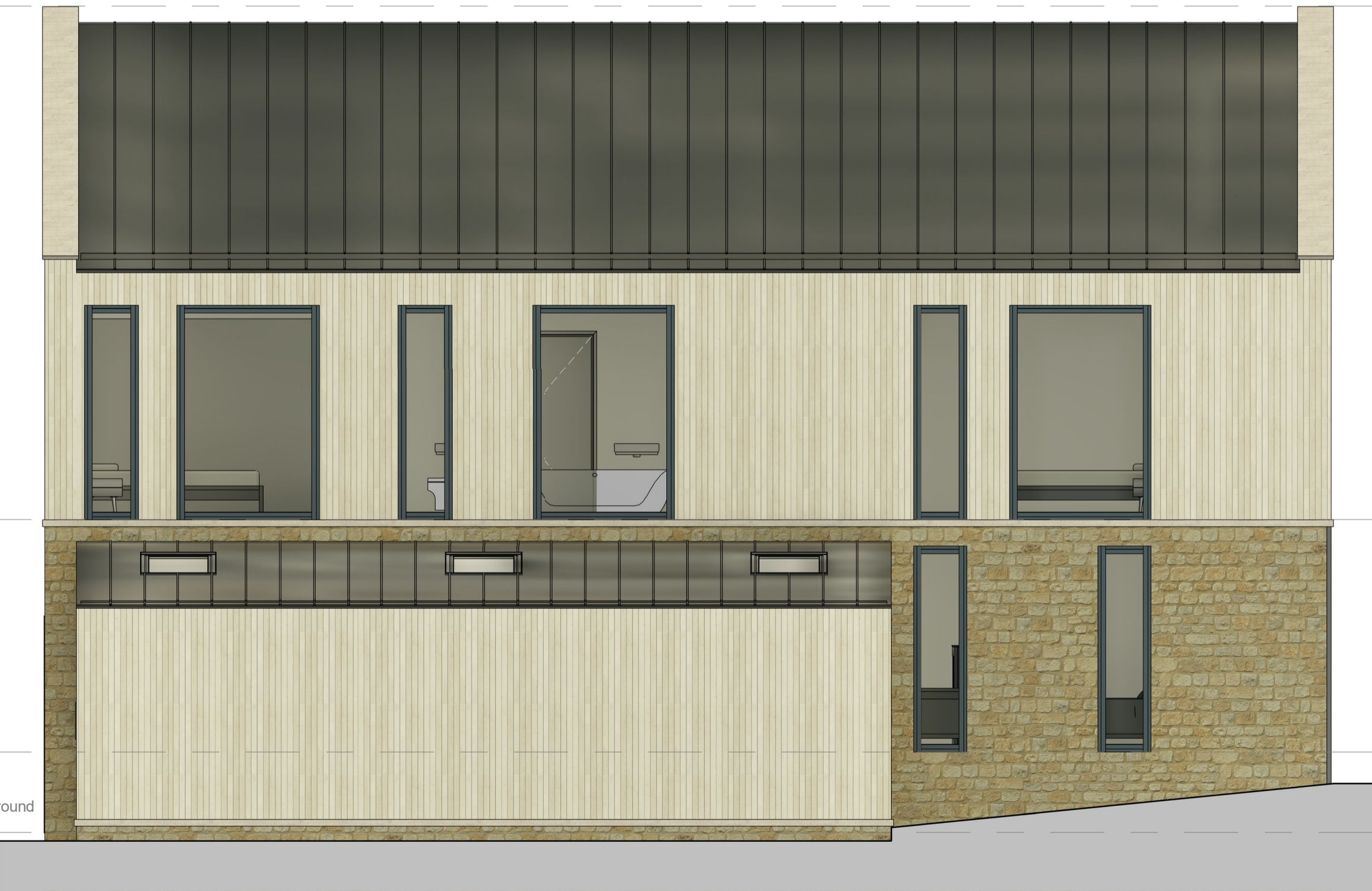
North Elevation - C