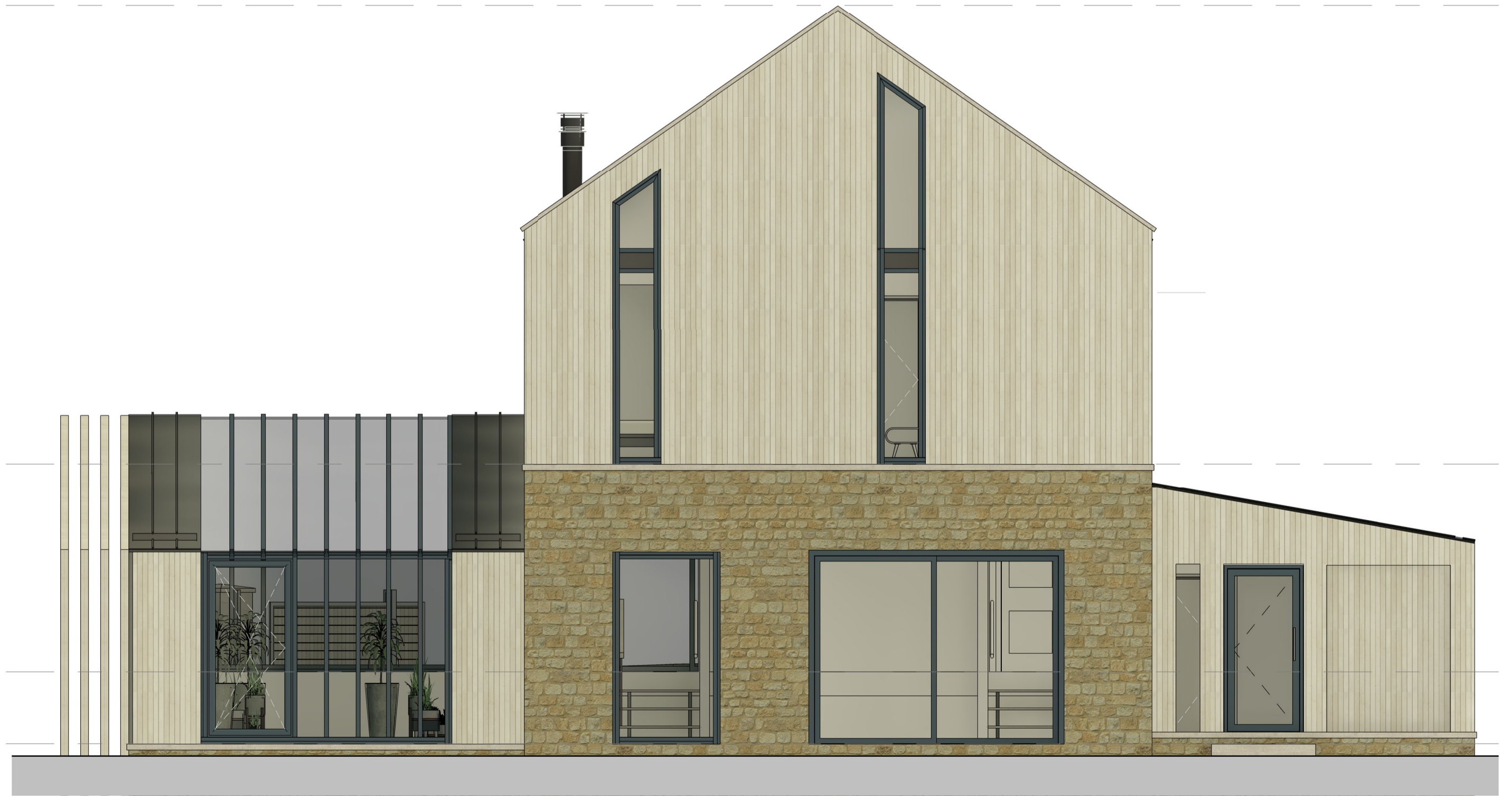
East Elevation - D