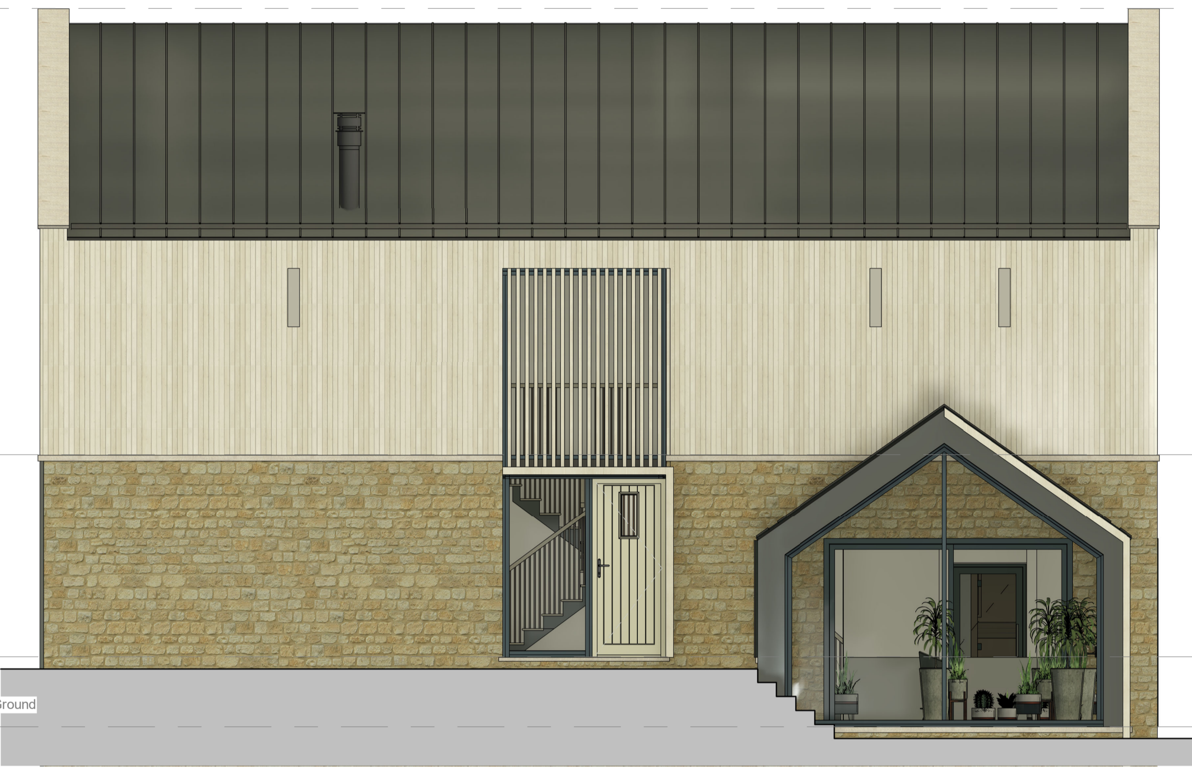
South Elevation - A