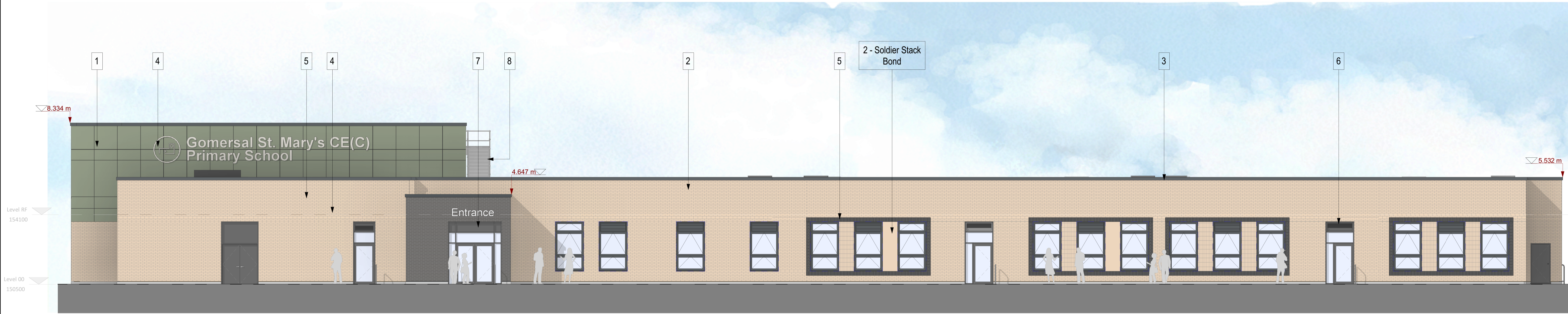
West Elevation (Front) 1:100