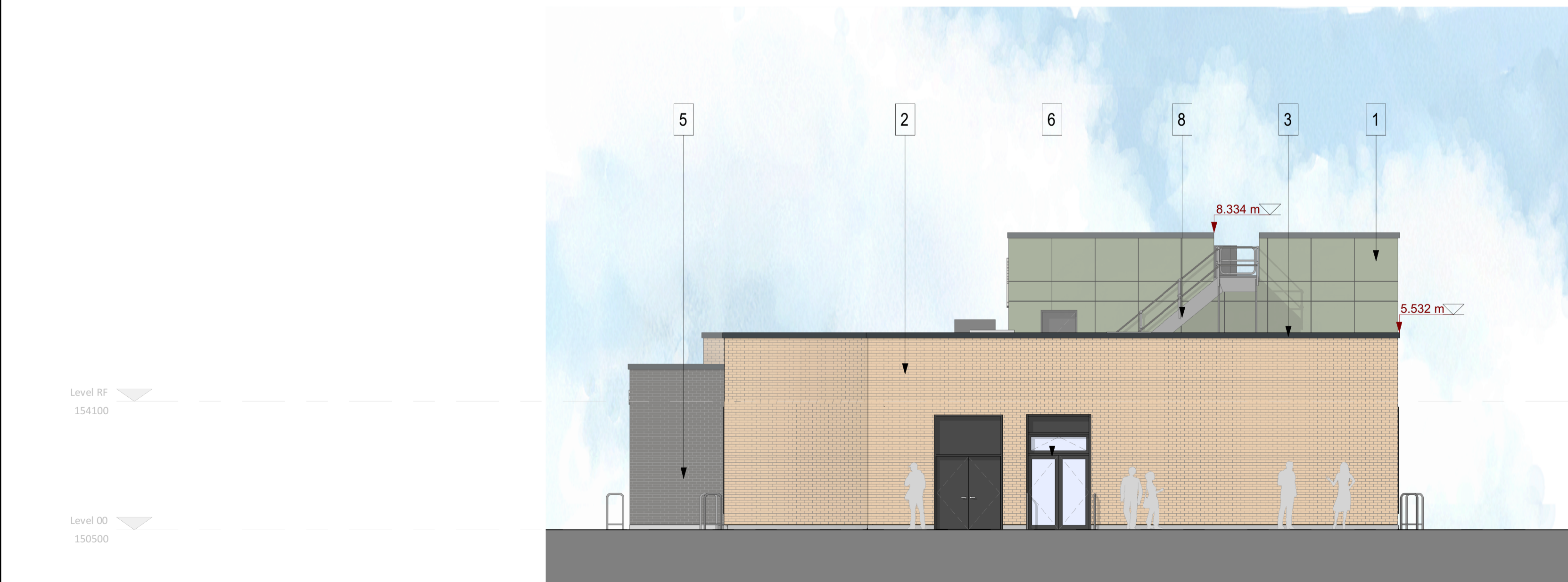
South Elevation (RHS) 1:100