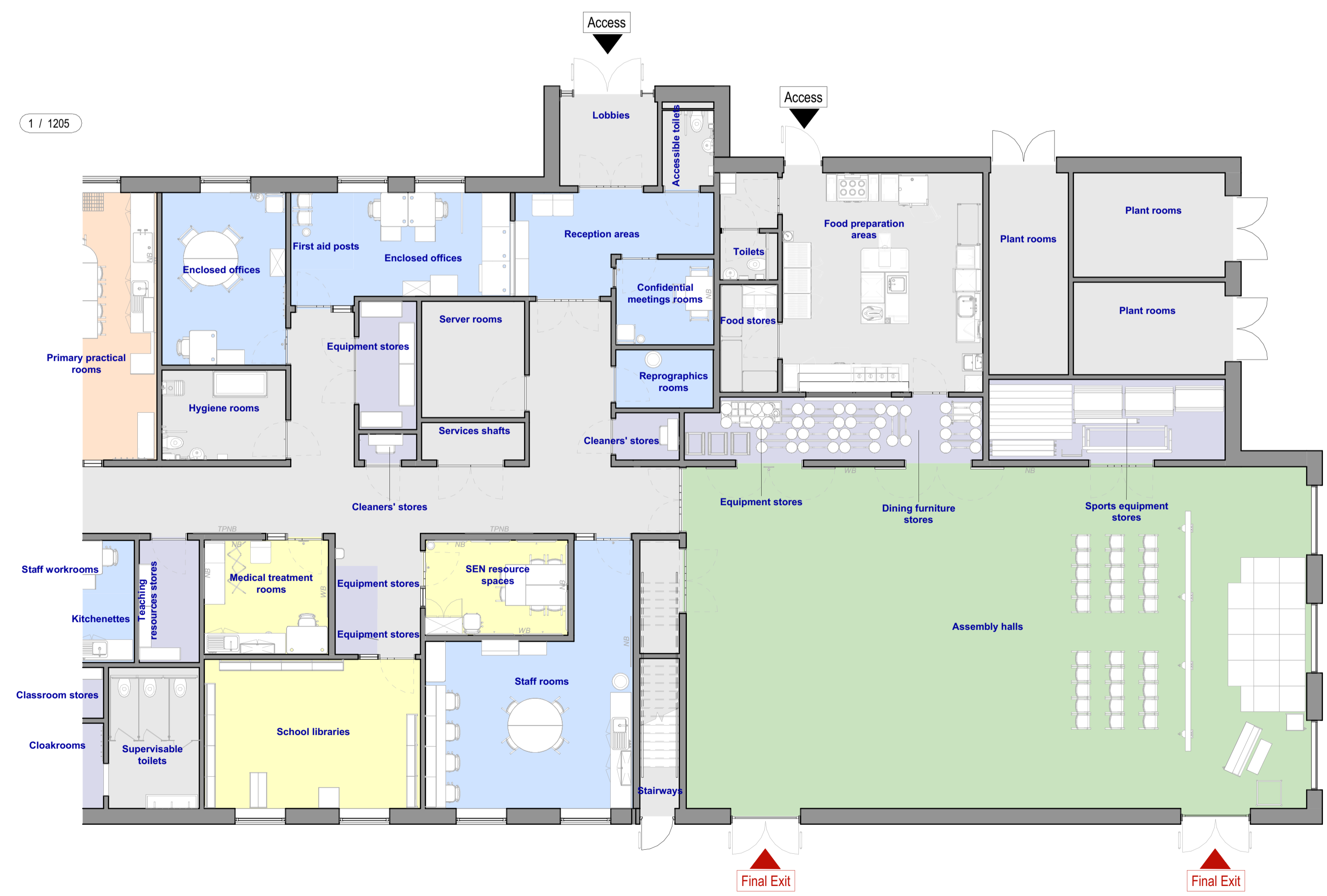
Planning 00_GA Plan - 2 of 2 Scale - 1 : 100