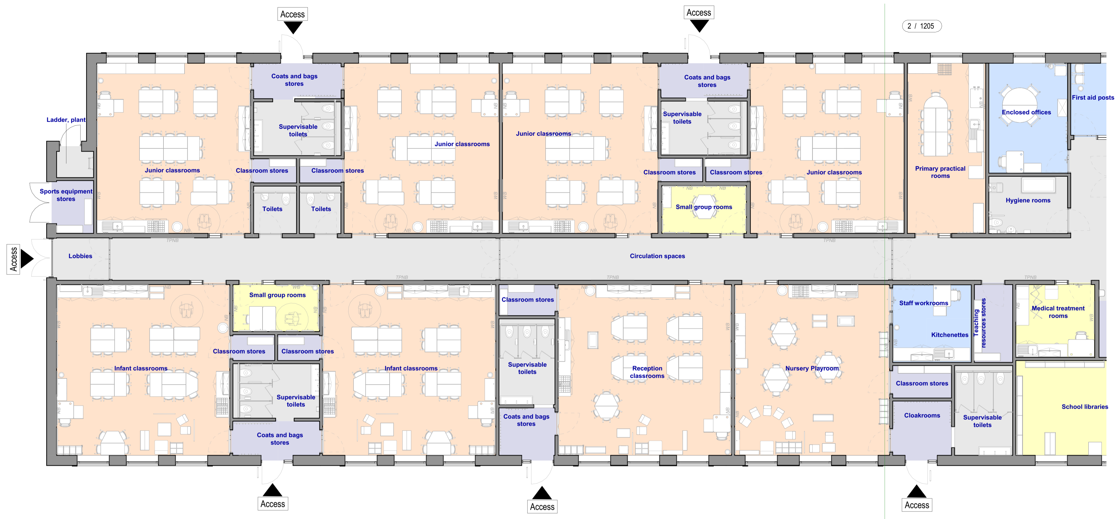
Planning 00_GA Plan - 1 of 2 Scale - 1 : 100