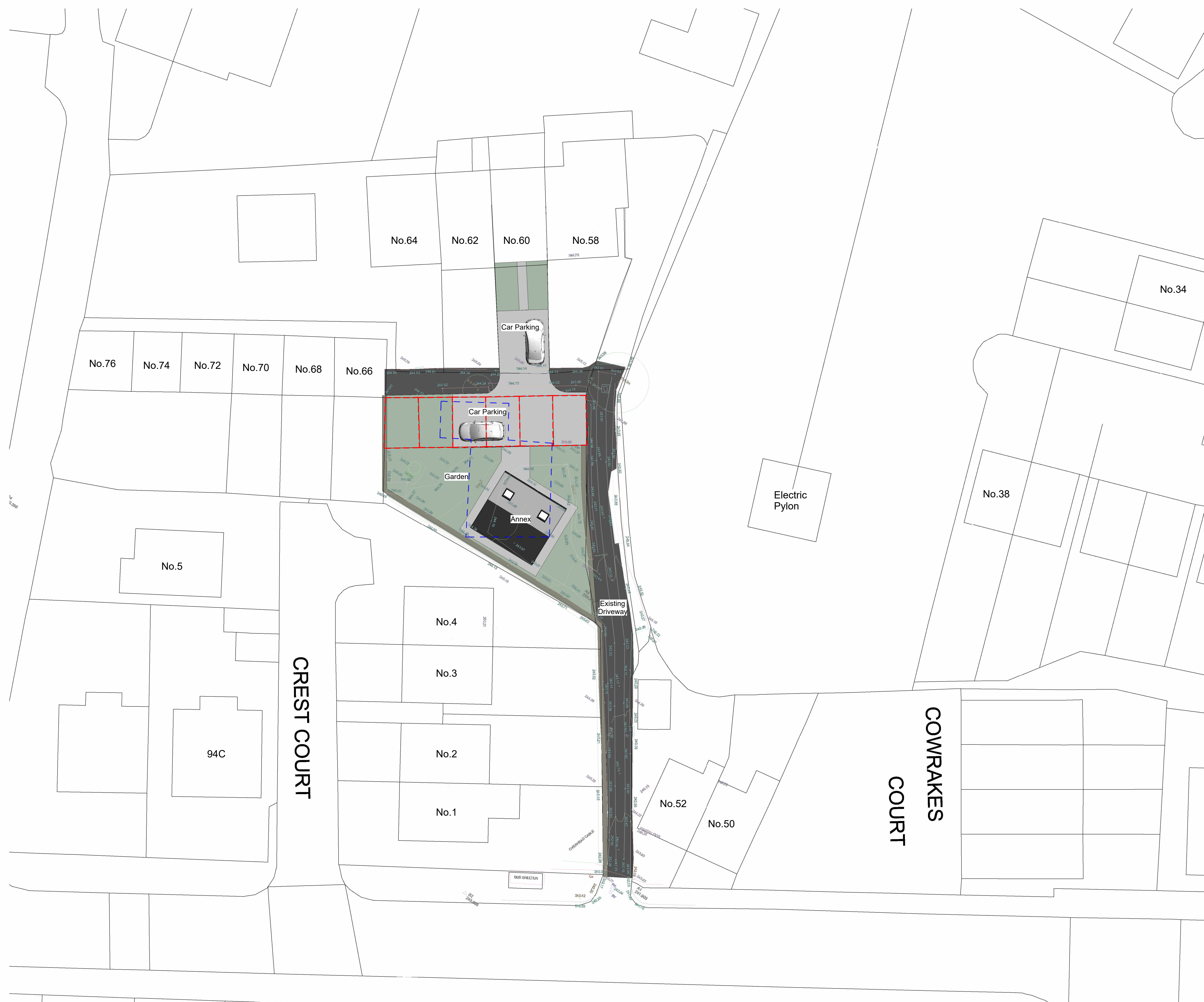
Site Plan Additional Context 1 : 200