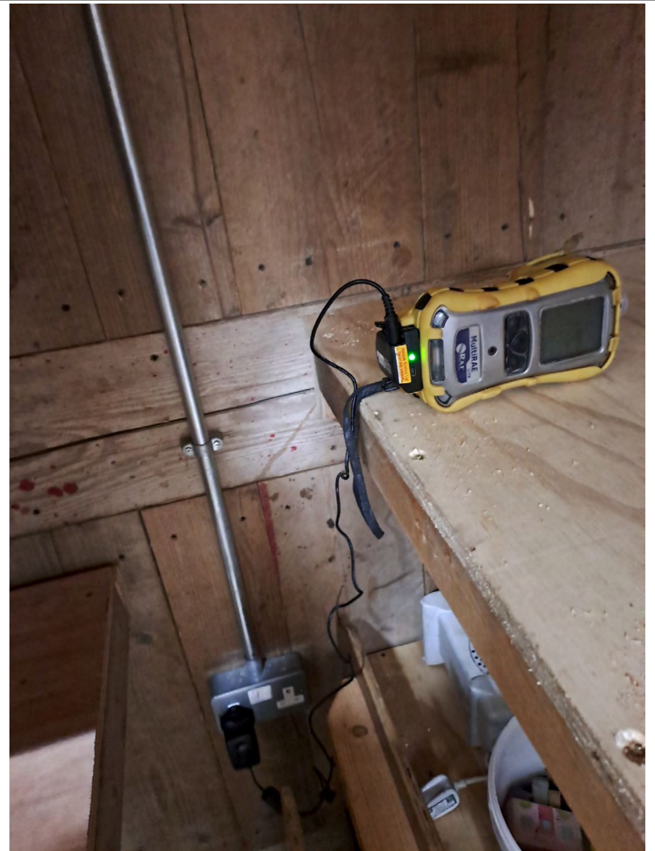
Photo 5: Monitor remained at this location and was collected 3 weeks after installation.