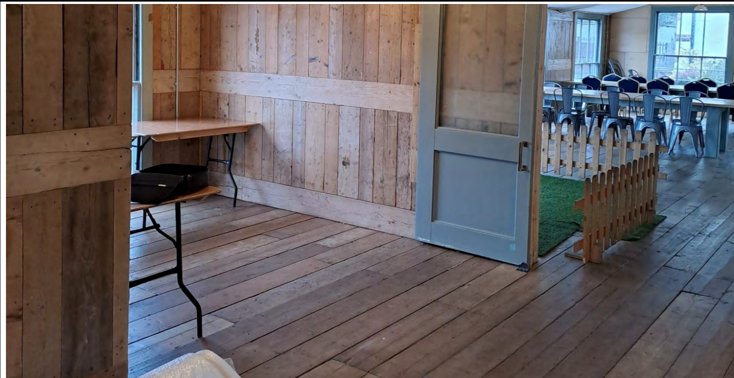
Photo 2: Walking in from east, it is evident that the majority of the structure is open plan.