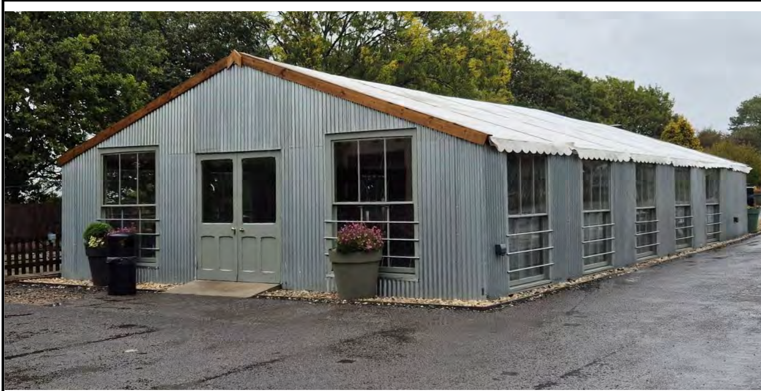
Photo 1: Structure constructed at Whistlestop Valley. Stone layer can be seen externally.