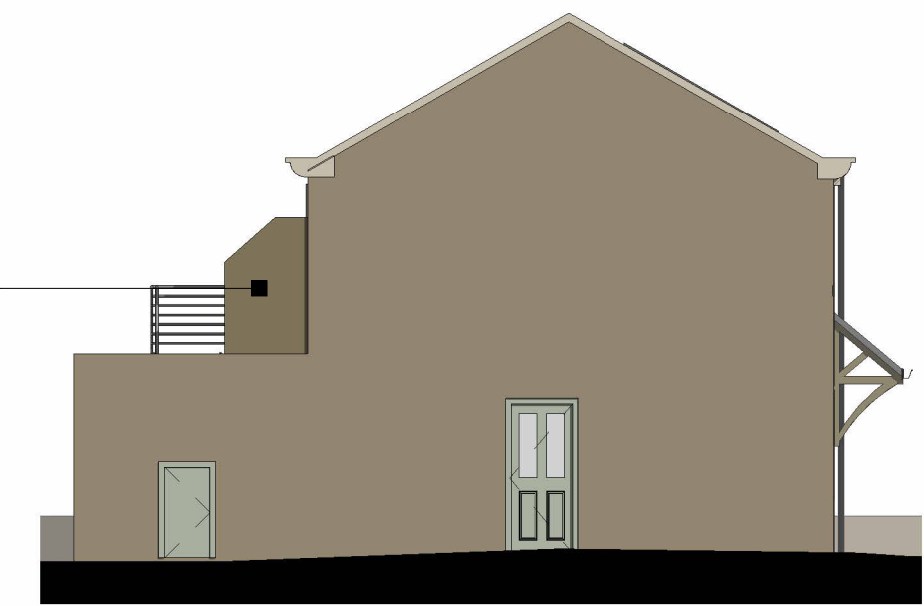
PROPOSED SIDE (SOUTH WEST) ELEVATION