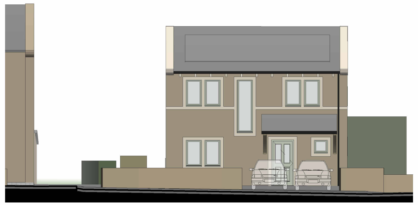
PROPOSED STREET-SCENE (SITE SECTION)