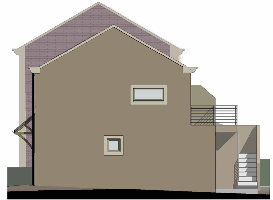
PROPOSED SIDE (NORTH EAST) ELEVATION