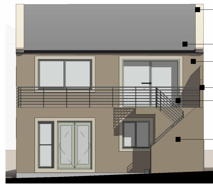
PROPOSED REAR (NORTH WEST) ELEVATION