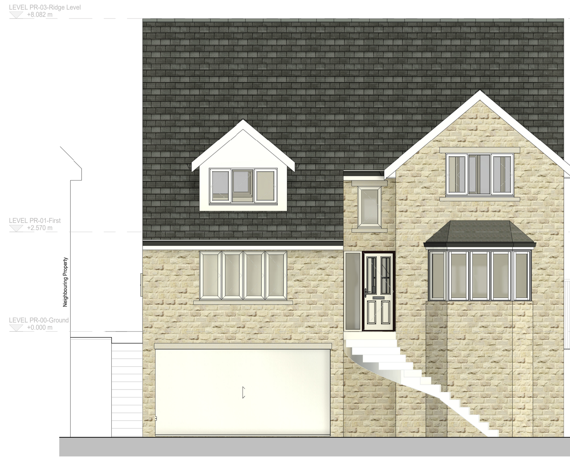
North Elevation - C 1 : 50