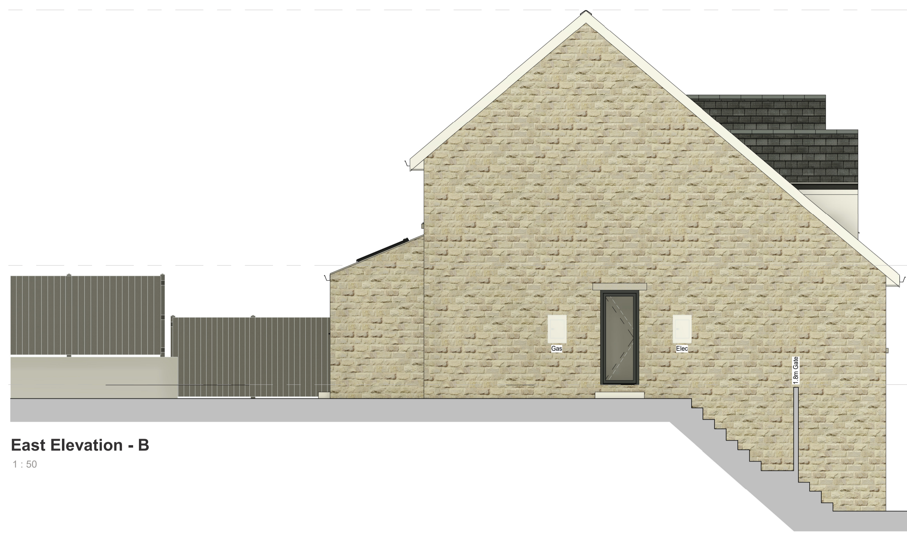
East Elevation - B 1 : 50