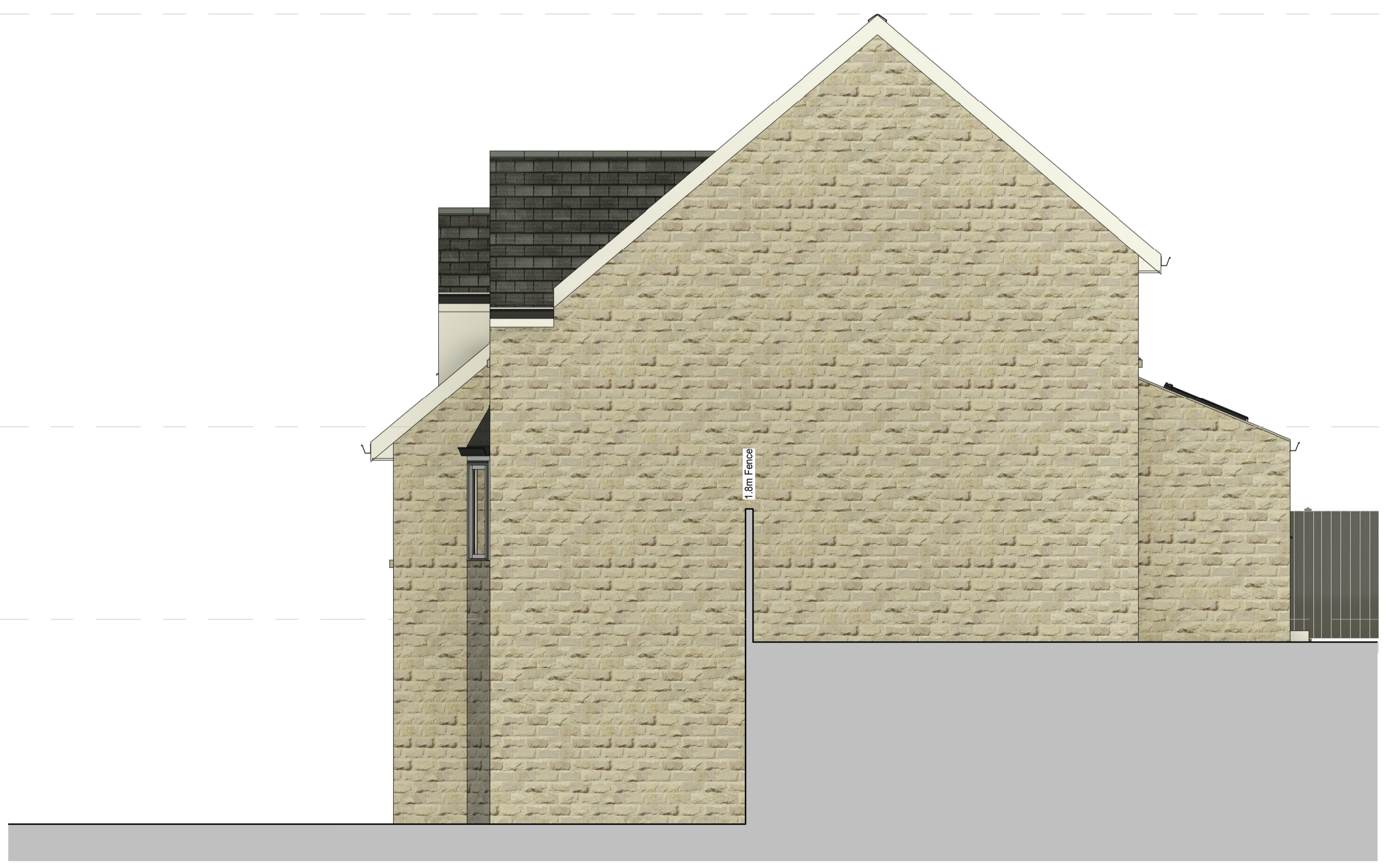
West Elevation - D 1 : 50