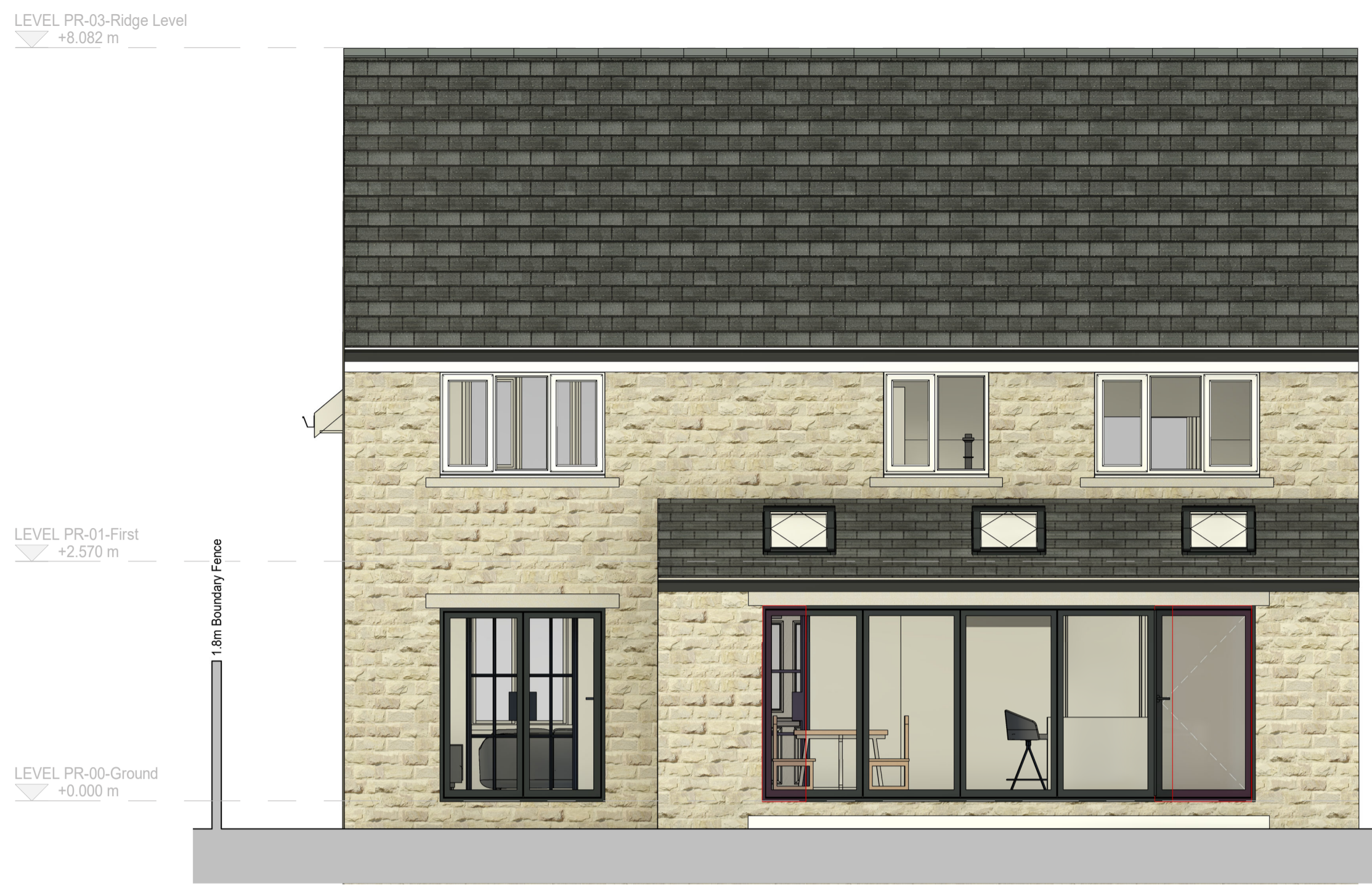
South Elevation - A 1 : 50