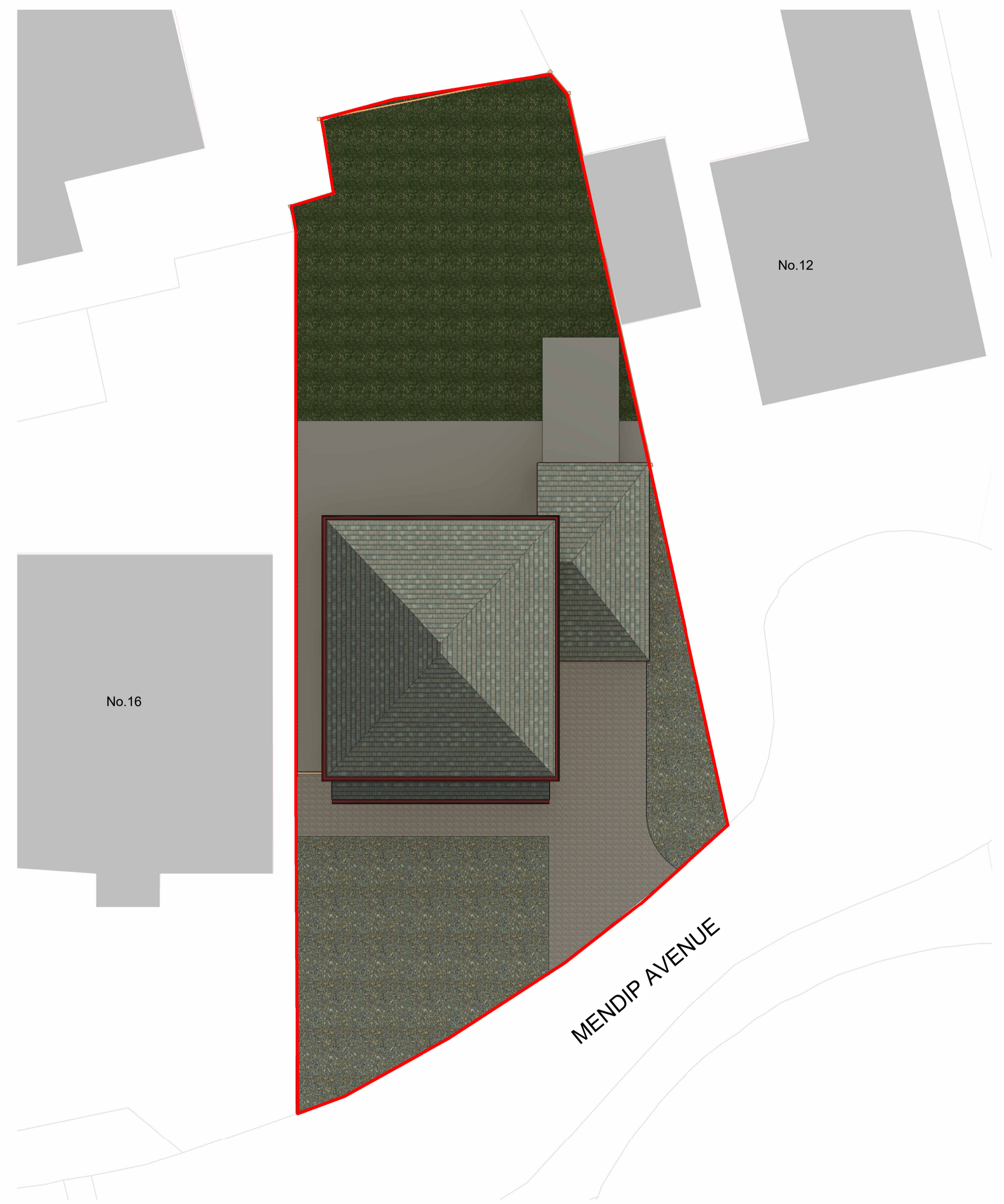
EXISTING SITE PLAN 1 : 100