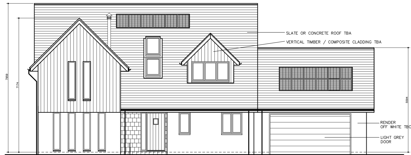
FRONT ELEVATION – EAST