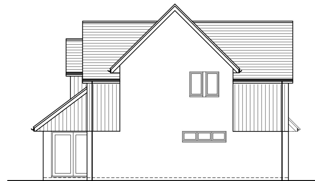
SIDE ELEVATION – SOUTH