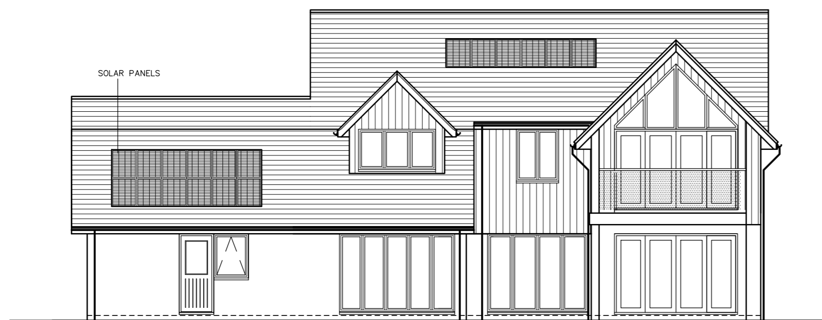
REAR ELEVATION – WEST