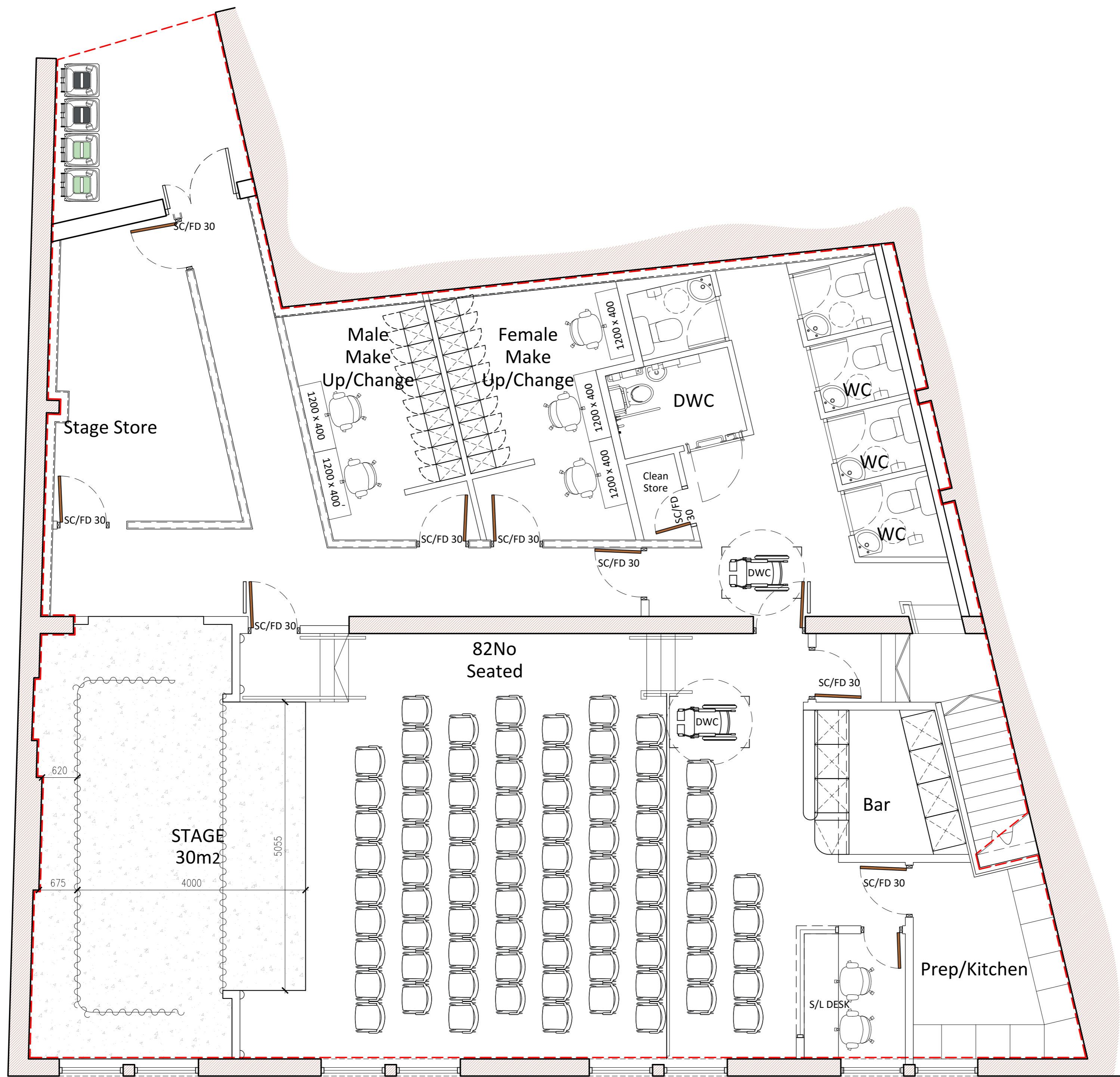
PROPOSED FIRST FLOOR

Main Contractor must verify all dimensions on site before commencing any work or stop drawings. Only figured dimensions to be taken from this drawing. Do not scale off this drawing.