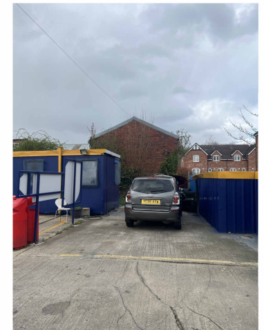
1. Existing industrial building to north of site.