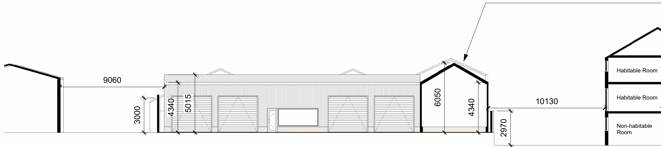
Proposed Site Section - Neighbouring Impact

Main living area of the properties is located on the first floor, minimising impact on daylight and outlook to neighbouring dwellings.