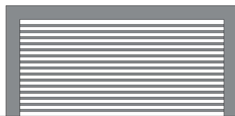
SIDE ELEVATION 1:50