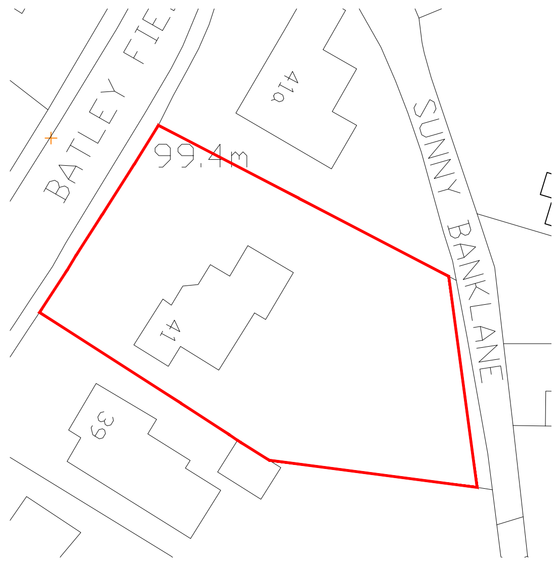
EXISTING BLOCK PLAN 1:500