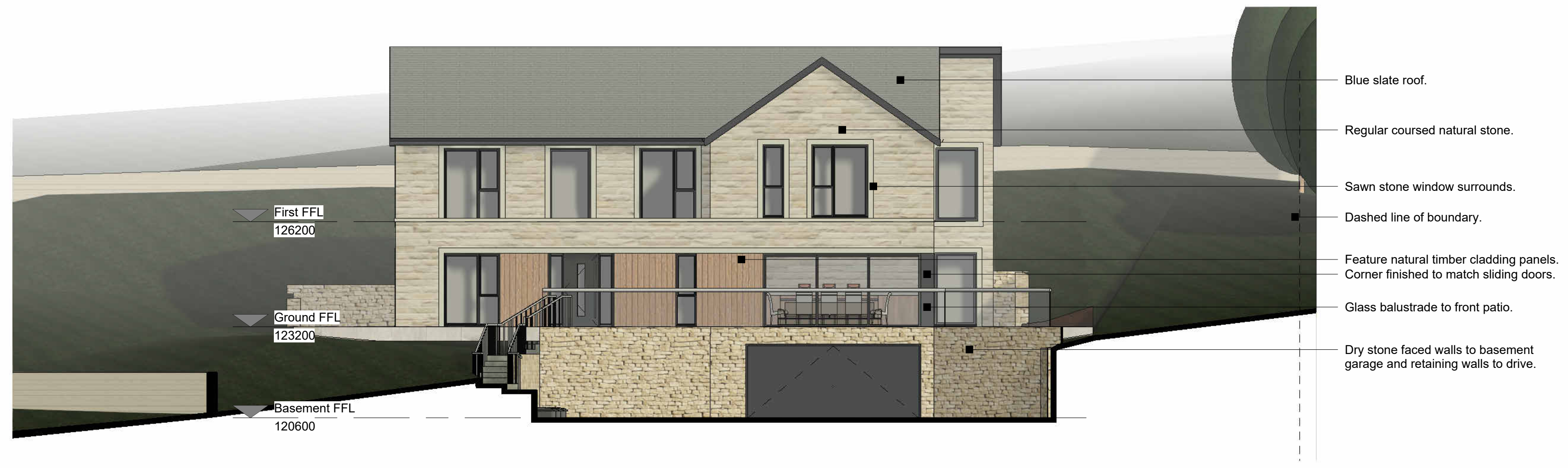
Proposed Front Elevation (North west) 1:100