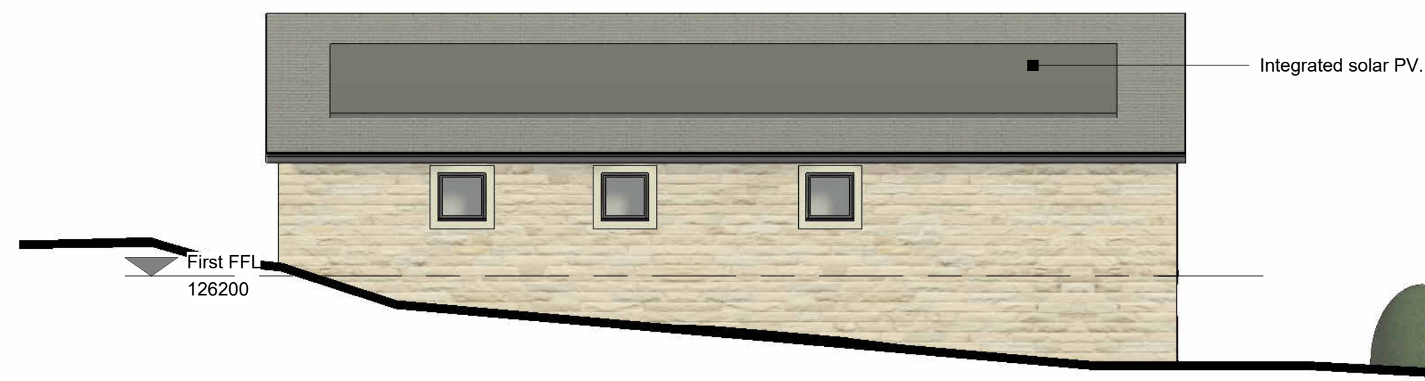
Proposed Rear Elevation (South east) 1:100