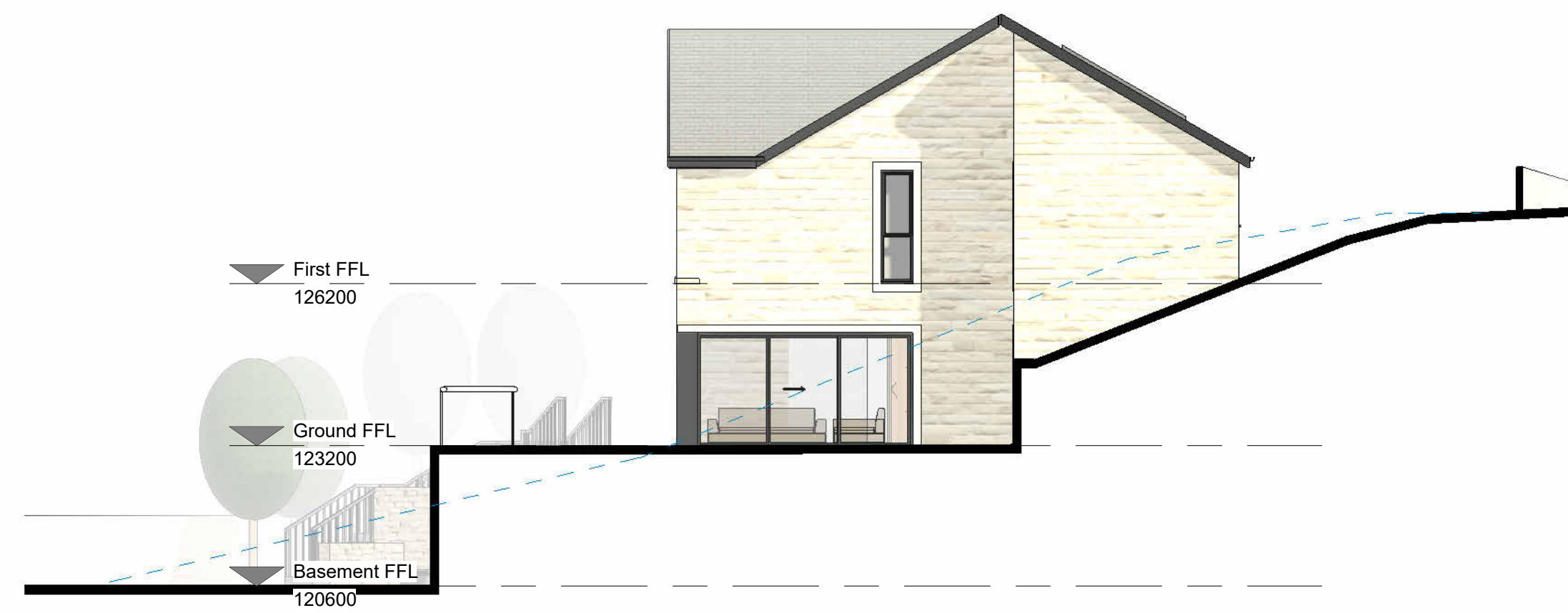
Proposed Side Elevation (South west) 1:100