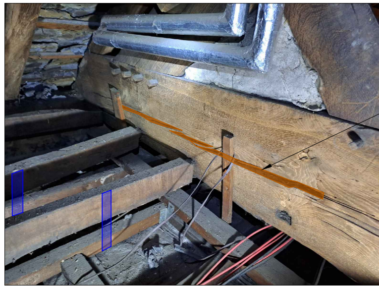
Infill splits and cracks with suitable timber resin the splits along the tie beams of trusses and ceiling beams.