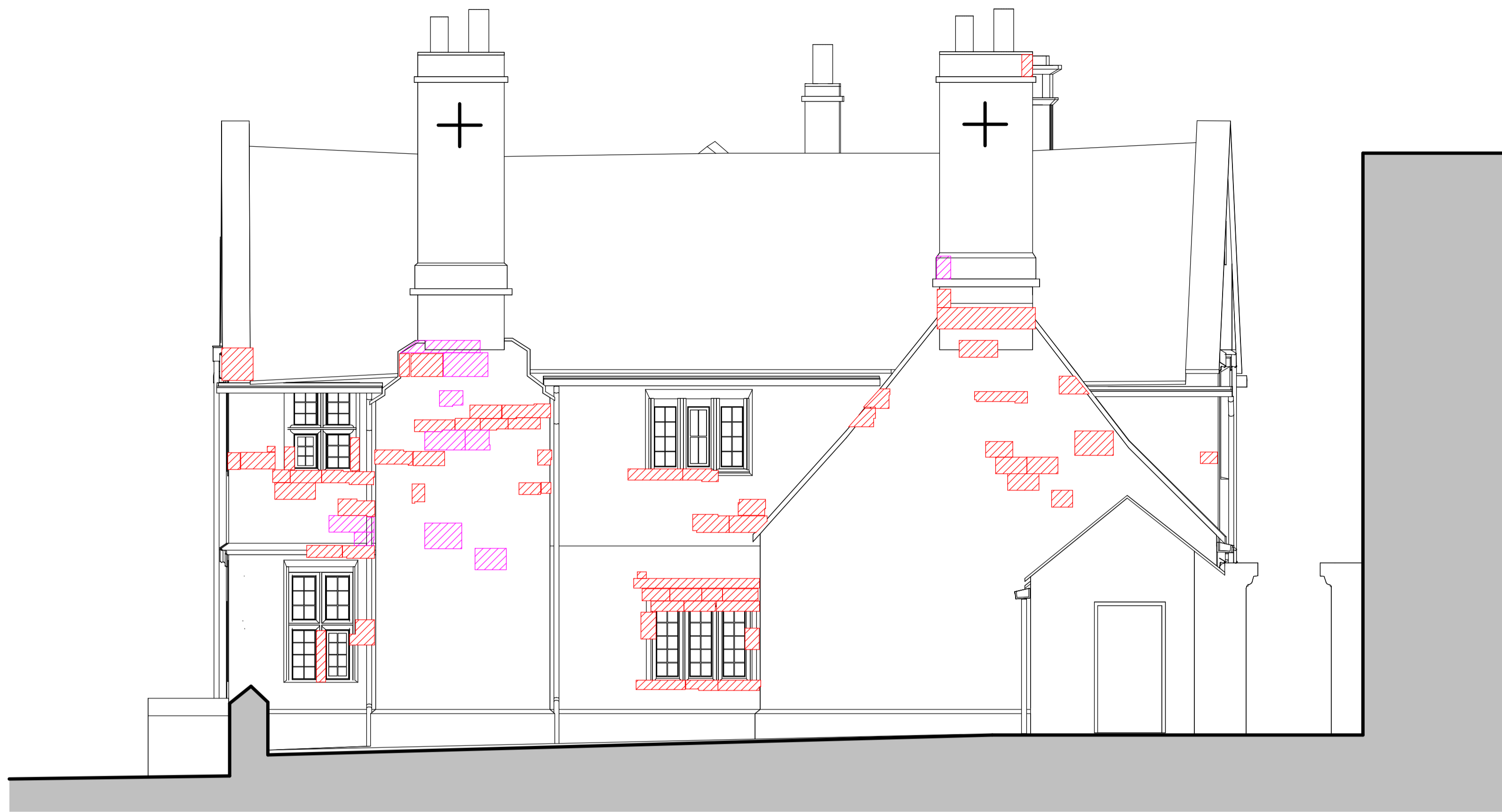
1 Proposed - South East Elevation 1 1 : 50