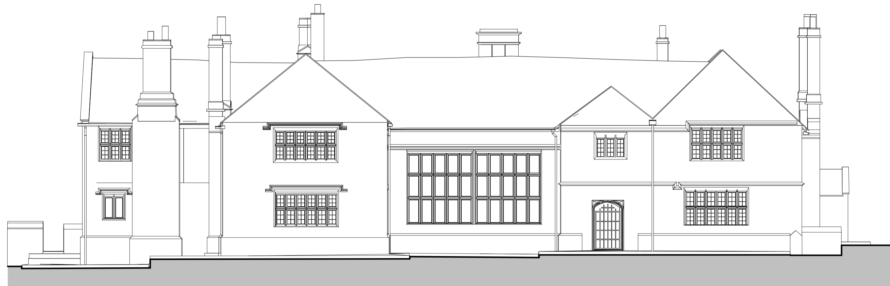
2 Existing South West Elevation 1 : 100