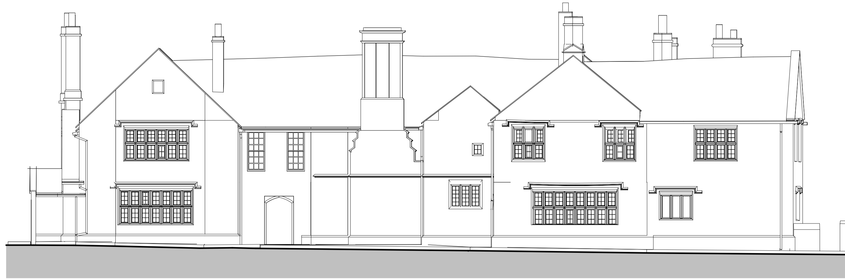
1 Existing North East Elevation 1 : 100