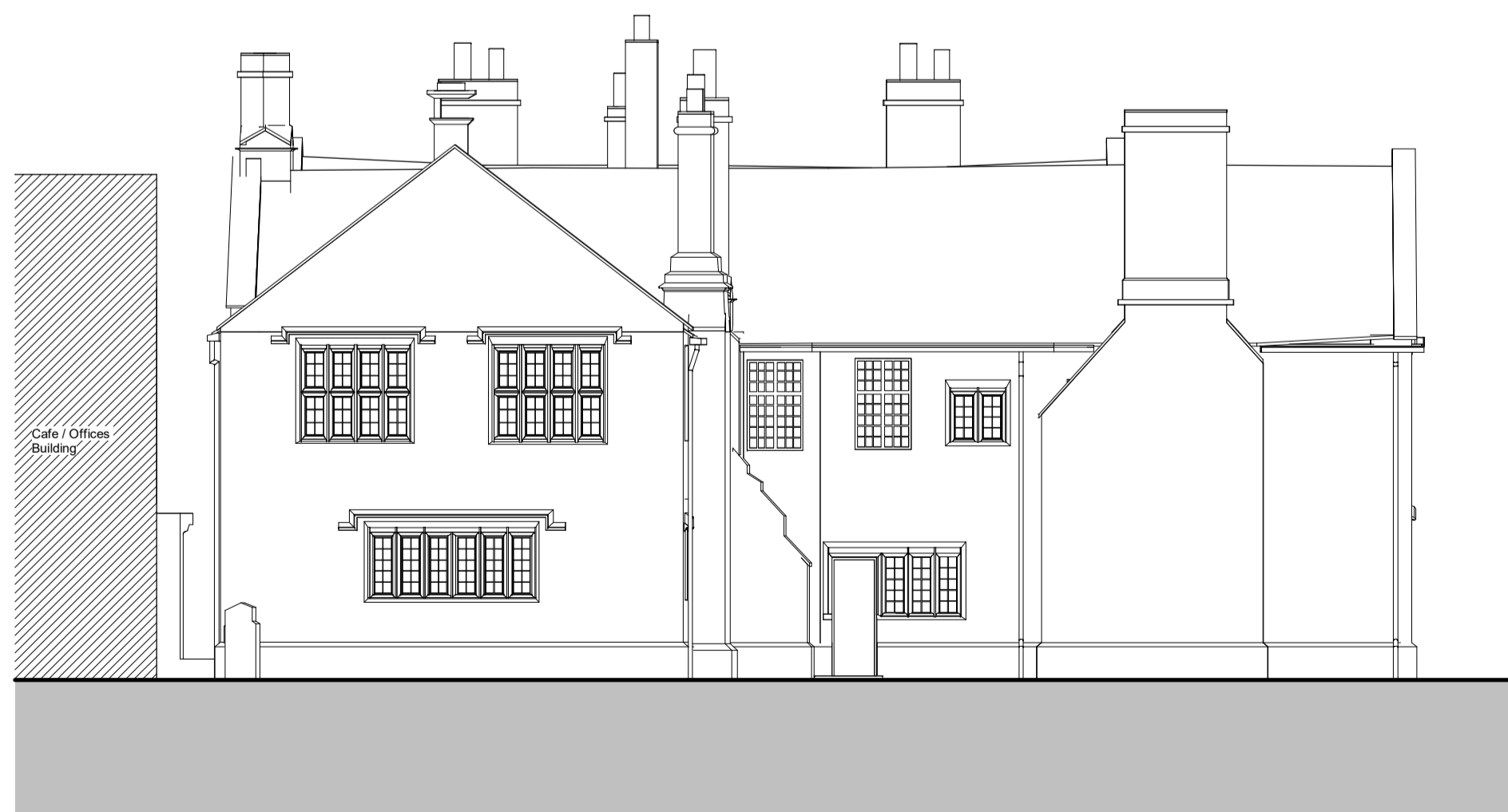
3 Existing North West Elevation 1 : 100