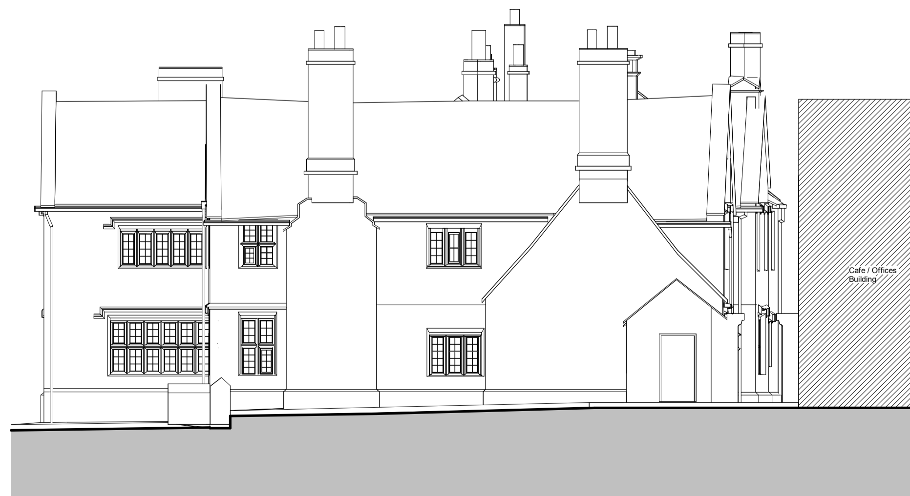
4 Existing South East Elevation 1 : 100