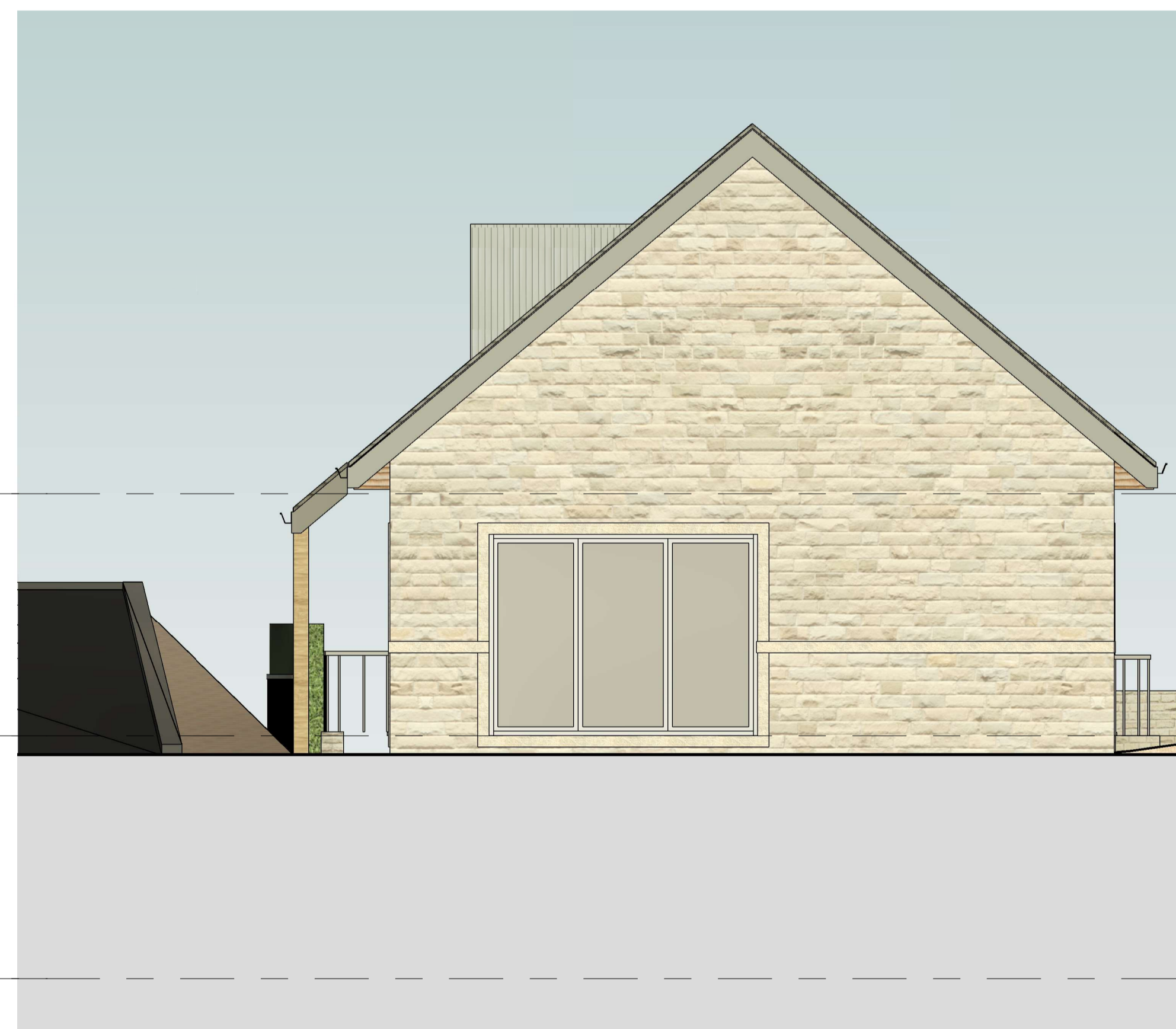
D PROPOSED SIDE ELEVATION 02 1 : 50