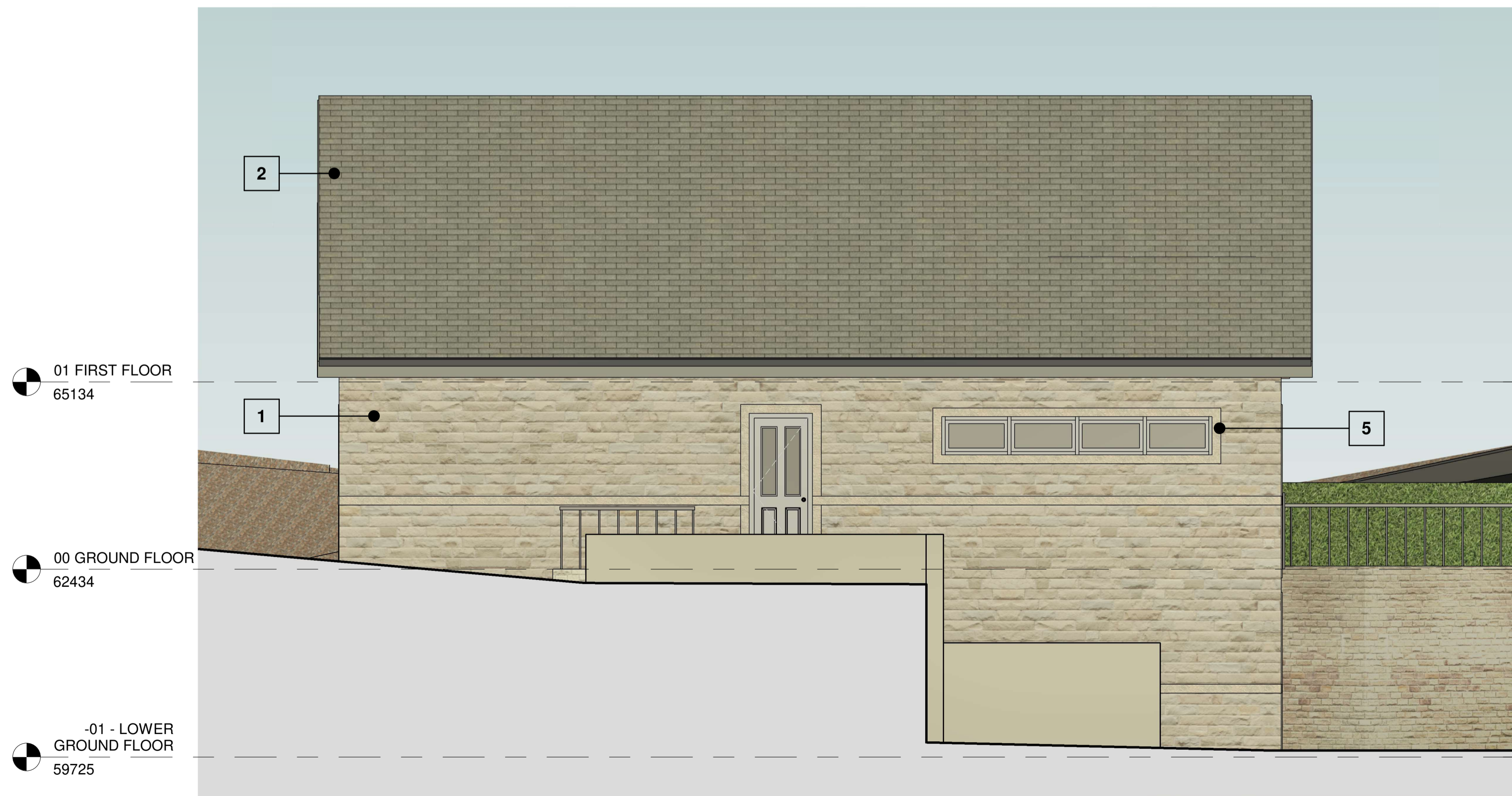
C - PROPOSED REAR ELEVATION 1 : 50