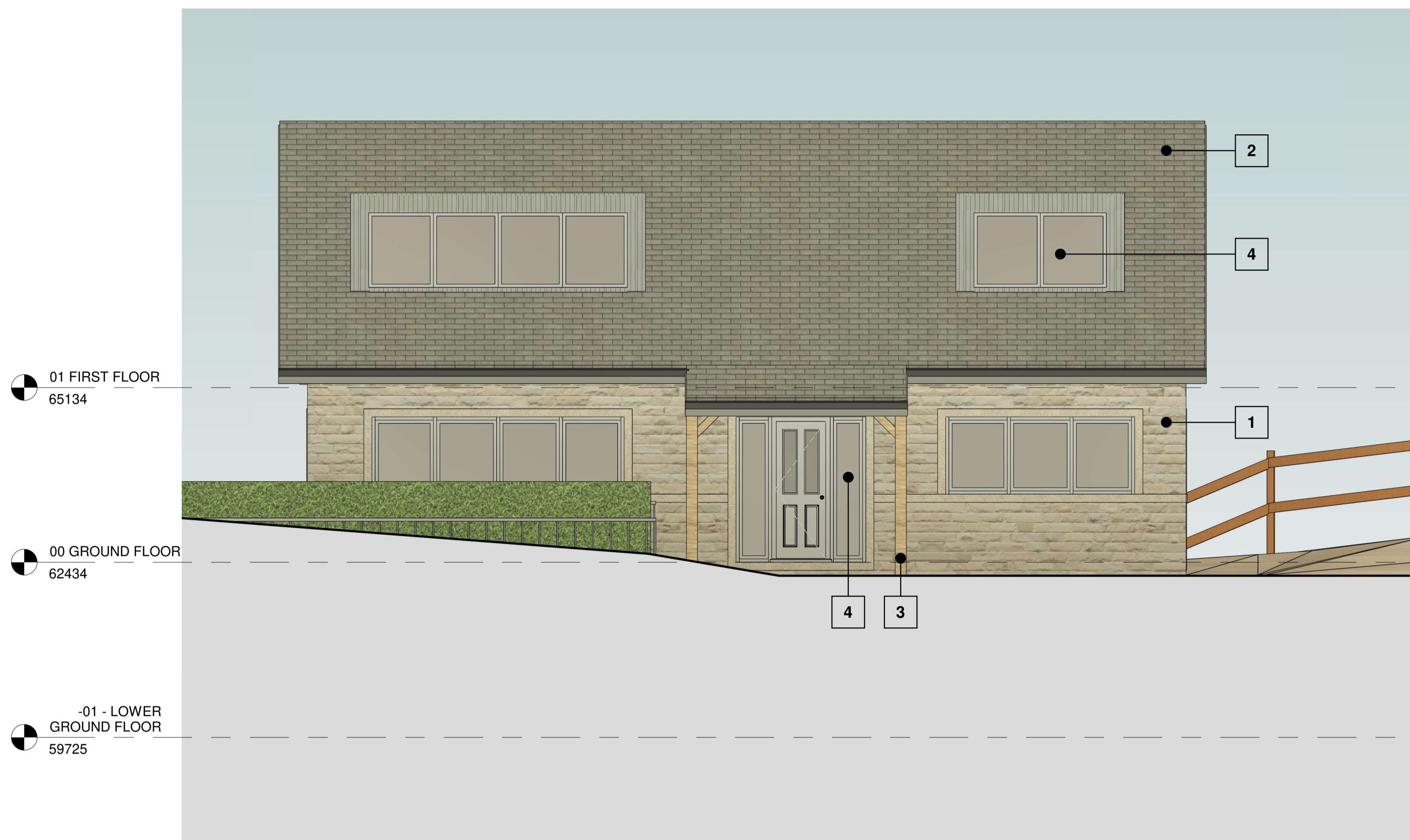
A - PROPOSED FRONT ELEVATION 1 : 50