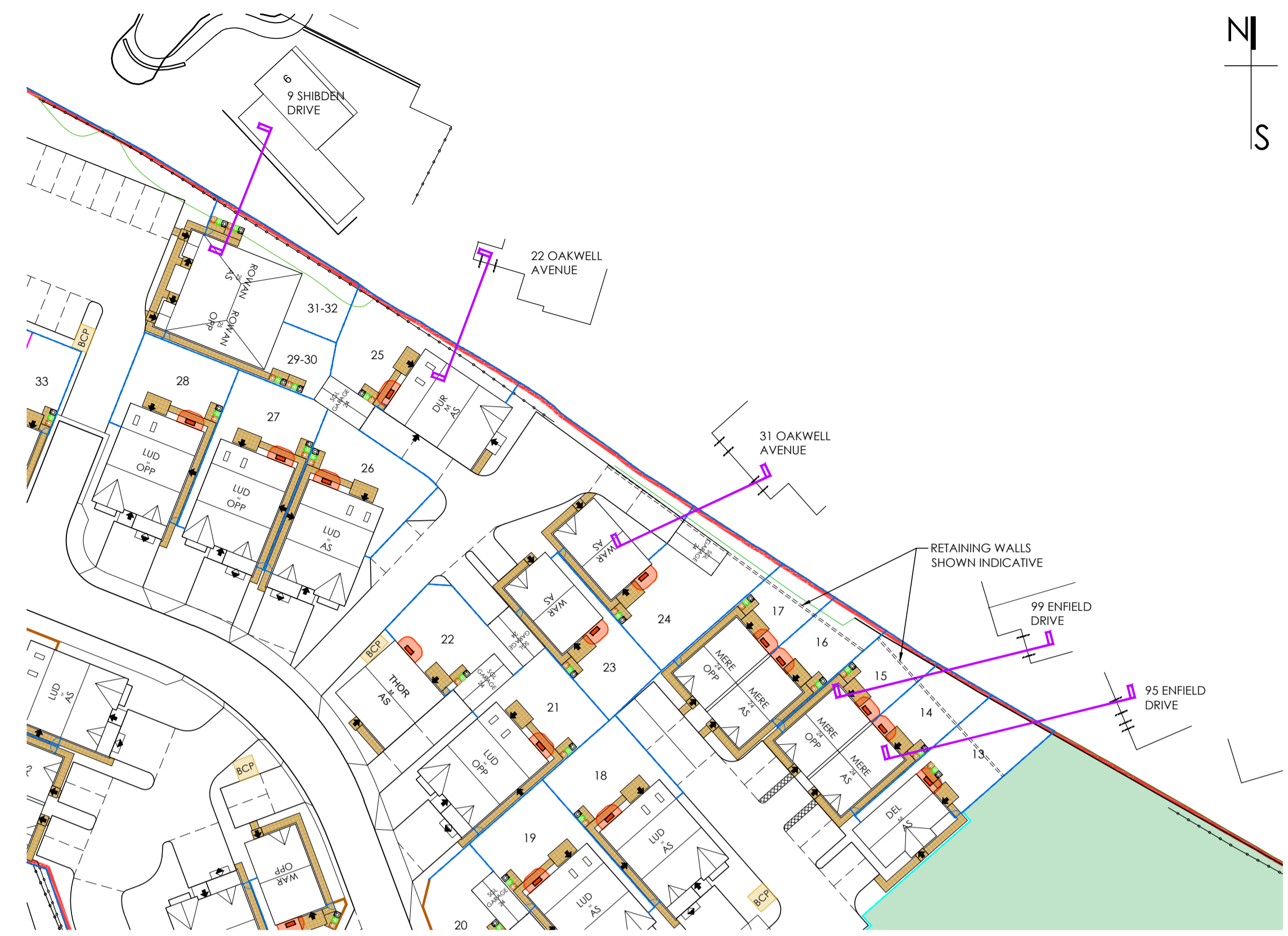
SITE LAYOUT EXTRACT @ 1:500