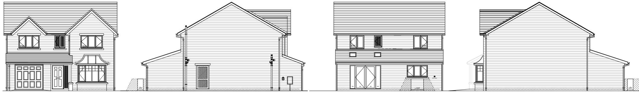
FRONT ELEVATION Scale 1:200