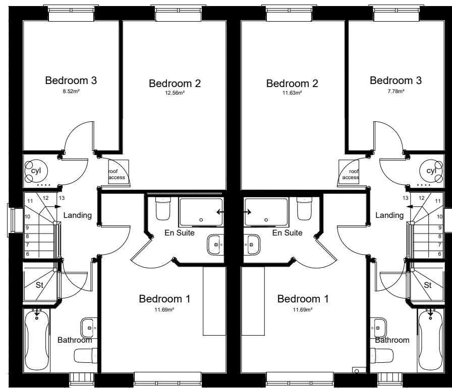
First Floor Scale: 1:100