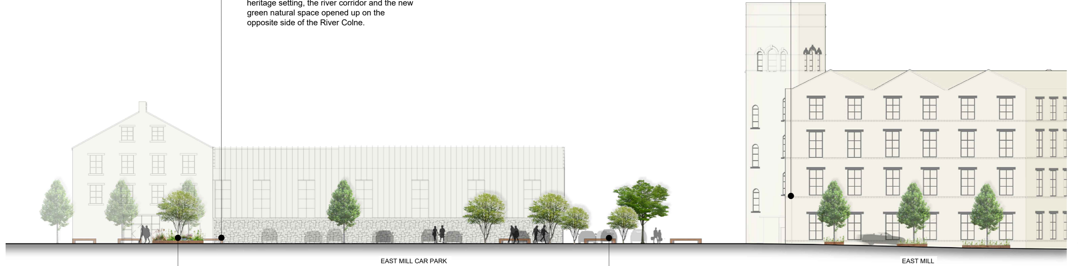
EAST MILL CAR PARK

Architectural references are incorporated in the external public realm design via hard landscape materials, paving layout and the inclusion of integrated reclaimed/retained heritage features.