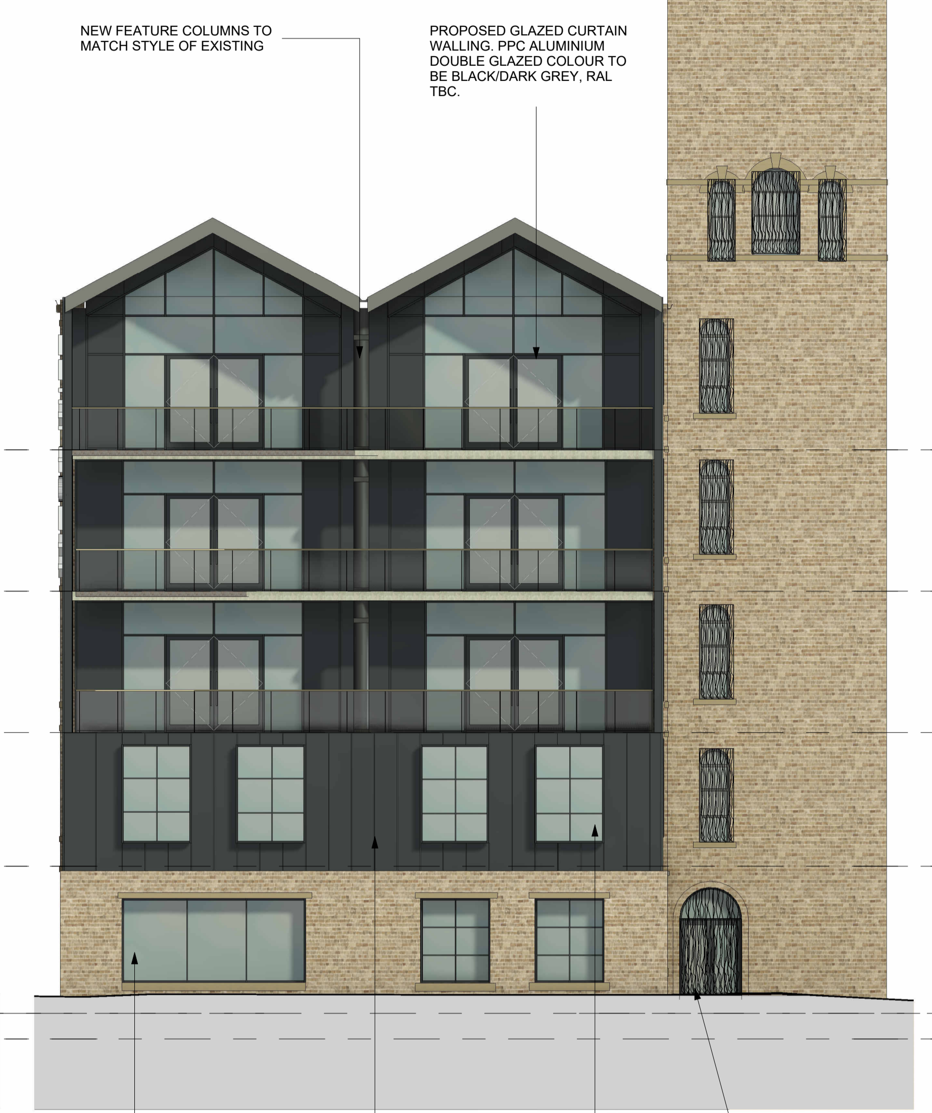
SOUTH ELEVATION PROPOSED 1 : 100