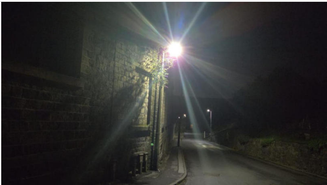
Photograph 4 – Exterior lighting