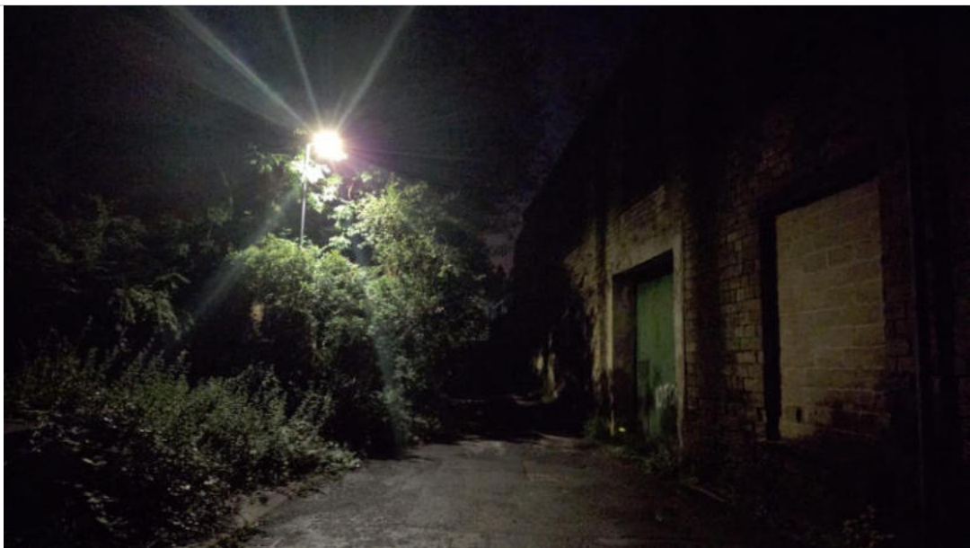
Photograph 6 – Exterior lighting