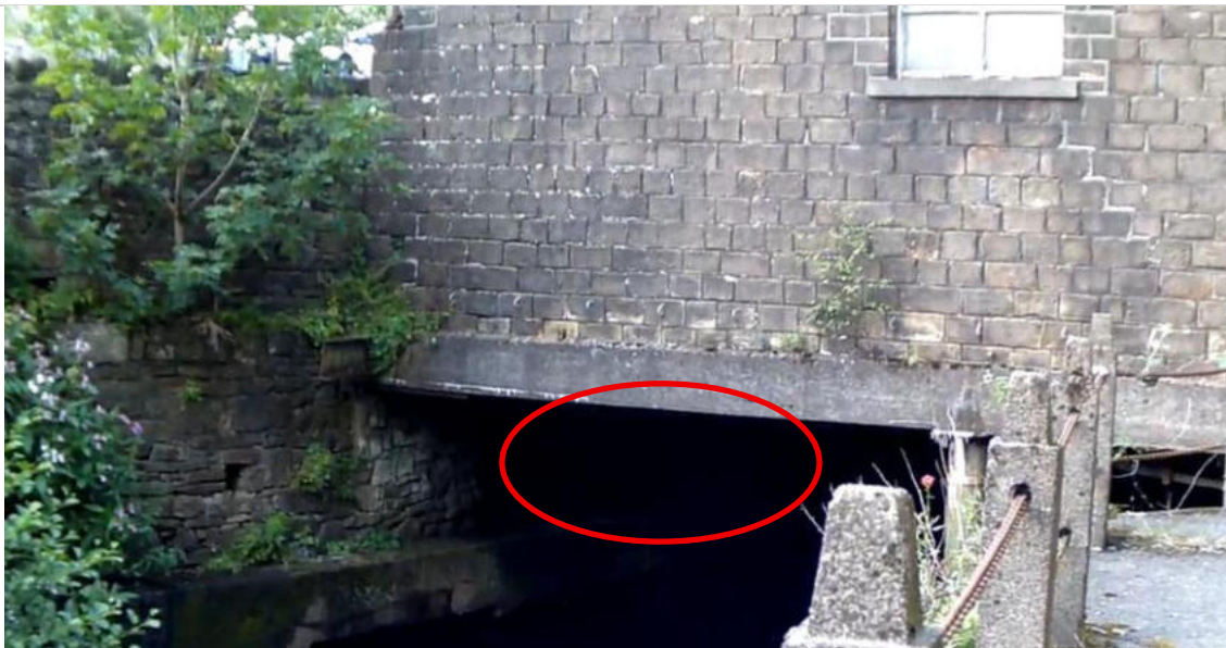
Photograph 2 – Location of Roost 2 (red circle)