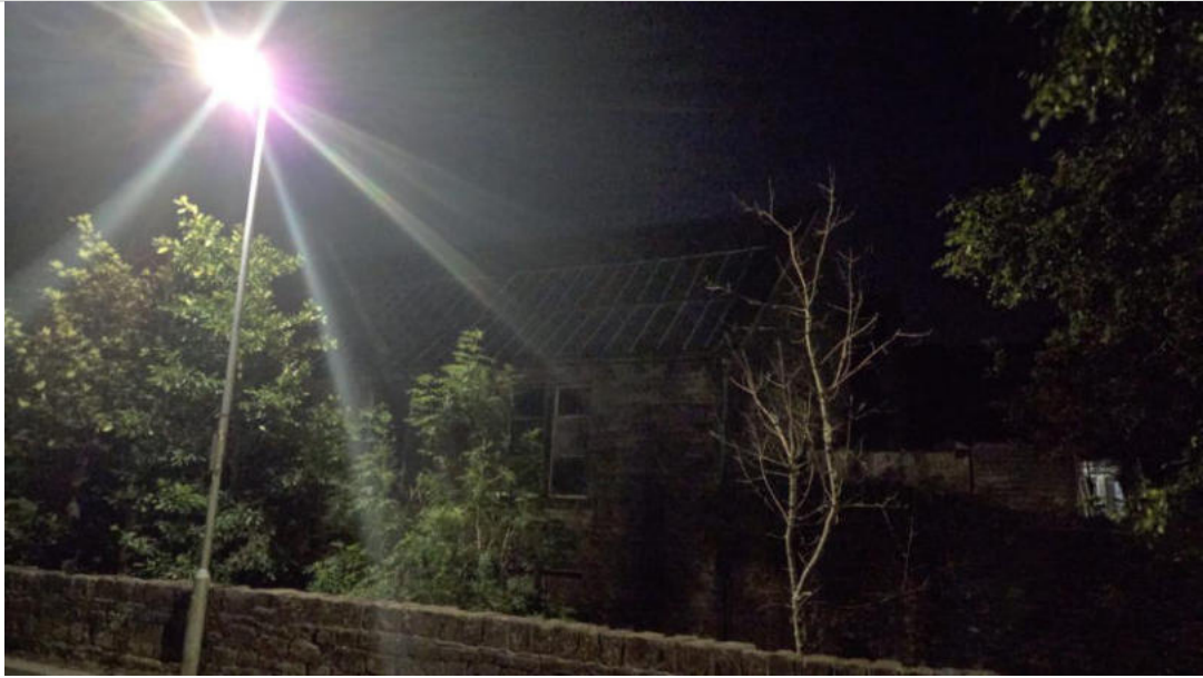
Photograph 5 – Exterior lighting