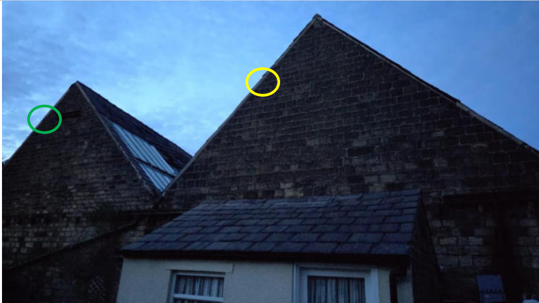
Photograph 3 – Location of Roosts 4 (green circle) and 5 (yellow circle)