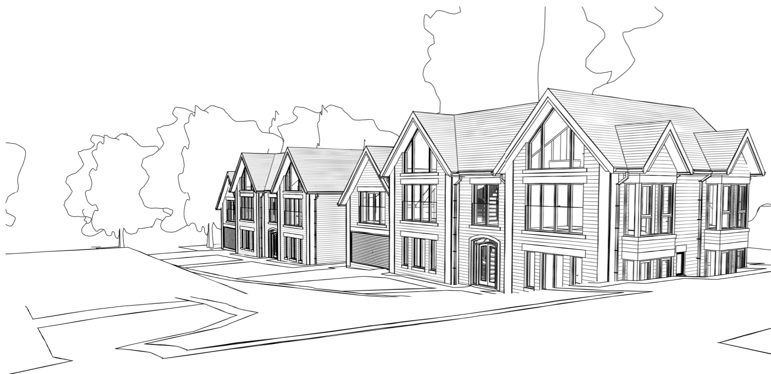
3D View 03