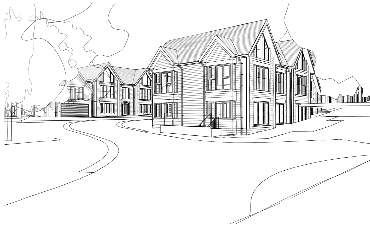
Entrance View 02