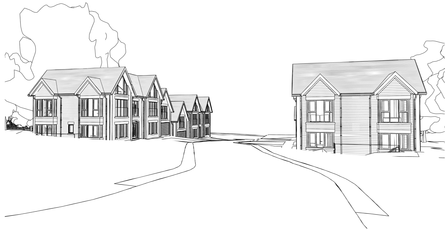
Entrance View 01