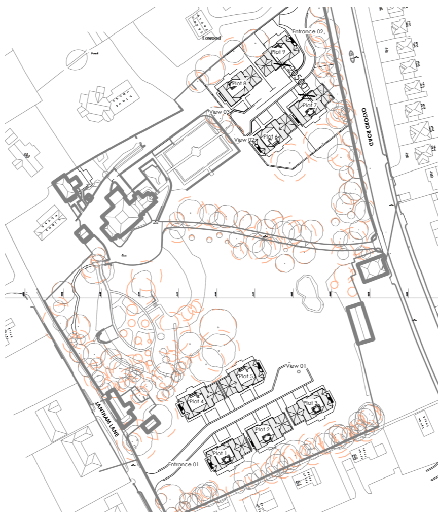
3D View Key