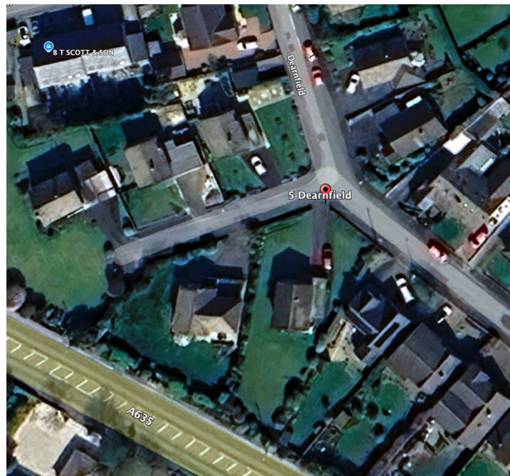
Google Earth image from 2025

The application site comprises a detached, two-storey residential dwelling situated on a corner plot within Dearnfield. The property benefits from substantial garden areas to all sides and forms part of a small cul-de-sac of five dwellings, including the application property. Vehicular access is achieved via a private driveway measuring approximately 15 metres in length, which provides adequate off-street parking provision and leads to an existing single-storey garage located within the curtilage.