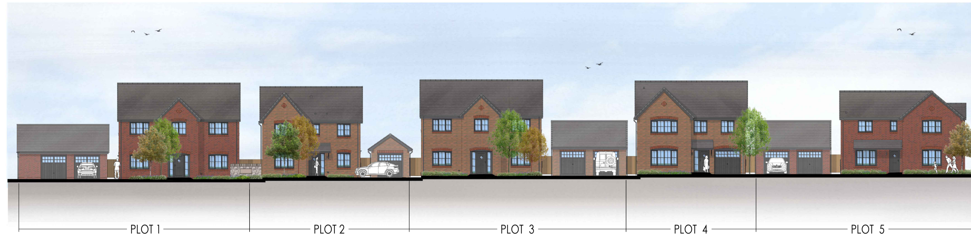
STREETSCENE A-A PLOTS 1-5 SCALE 1:200