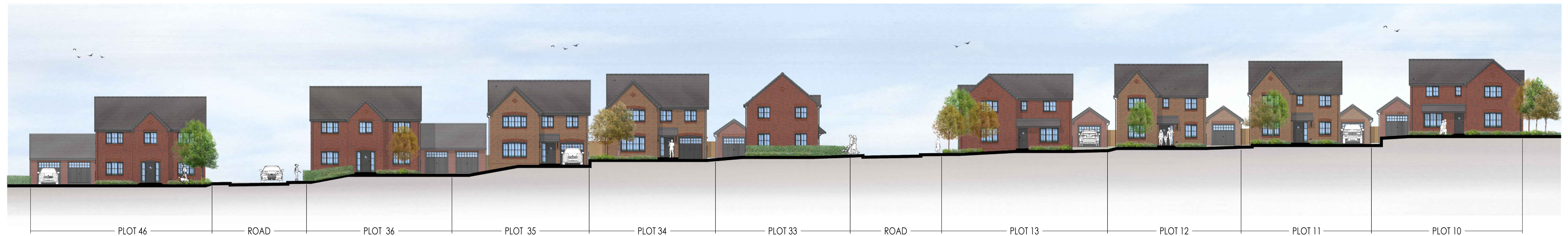
STREETSCENE B-B PLOTS 10-13, 33-36 & 46 SCALE 1:200