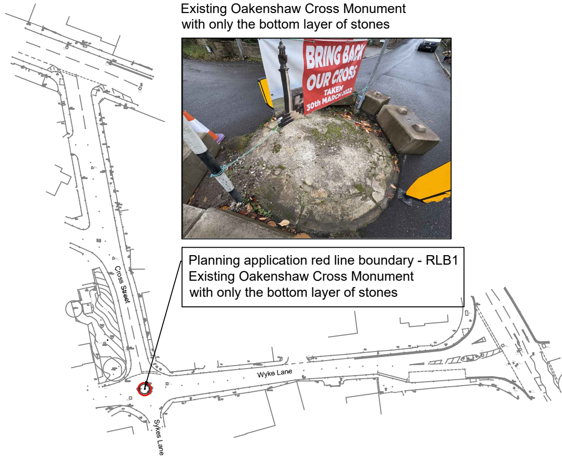
Existing Oakenshaw Cross Monument with only the bottom layer of stones