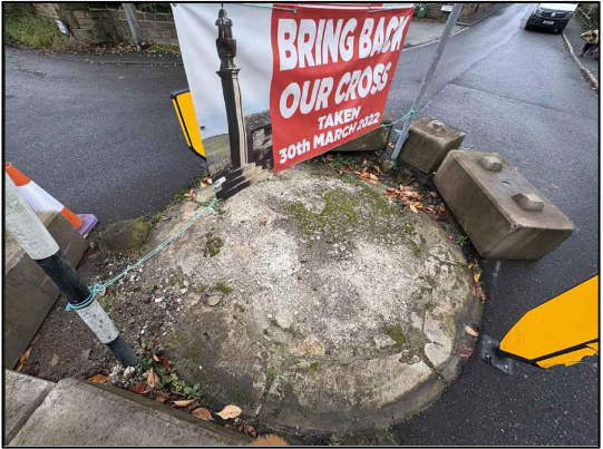
Planning application red line boundary - RLB1 Existing Oakenshaw Cross Monument with only the bottom layer of stones