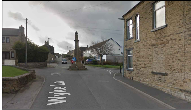
Planning application red line boundary - RLB1 Existing location for the Oakenshaw Cross Monument