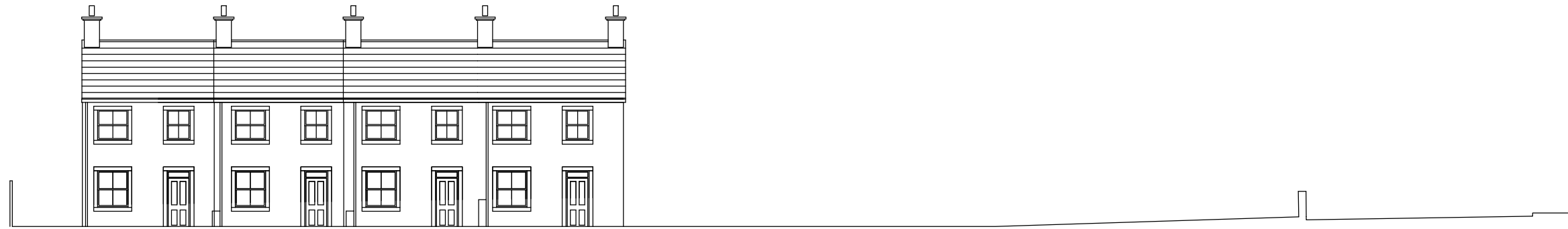
Cross Section of Site