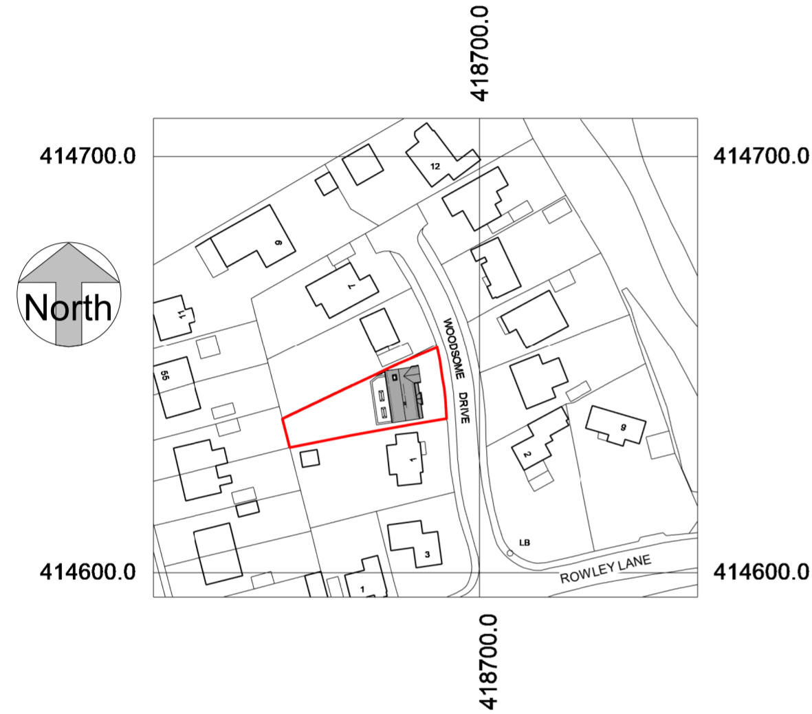
Site Location Plan 1 : 1250