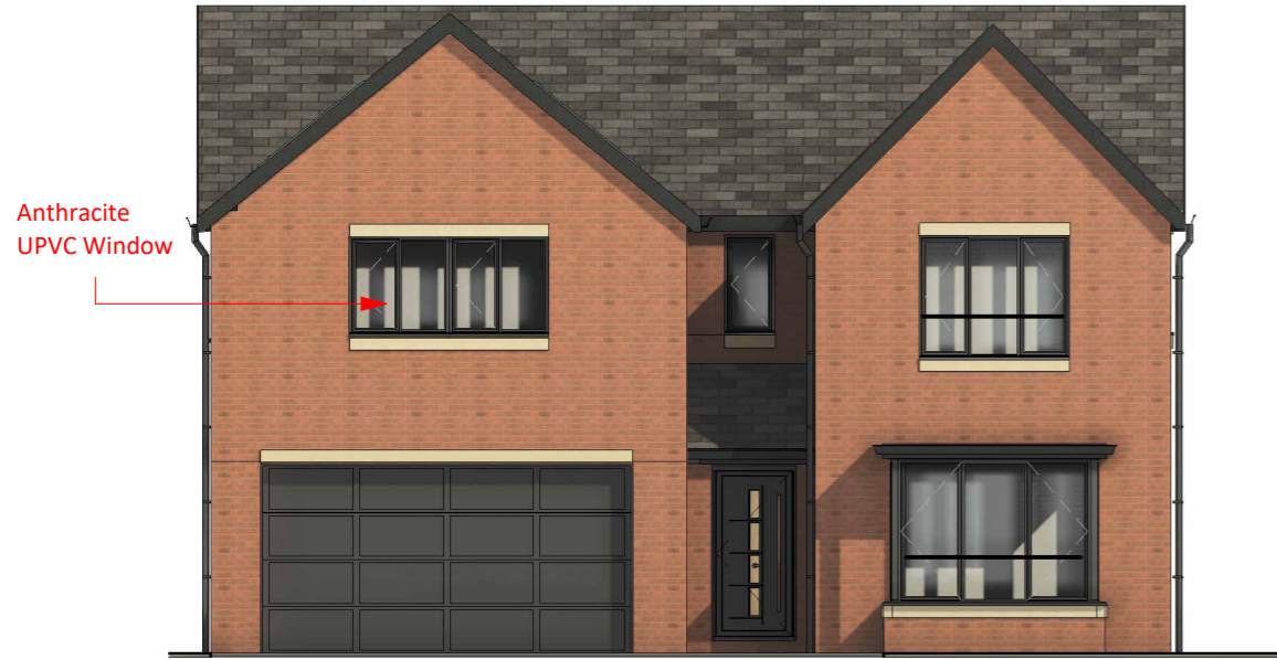
2 11 Proposed South Elevation 1 : 100

NOTES - Do not scale from this drawing. - Due to the nature of the project (existing property) dimensions may vary on site to those shown. - The contractor and any specialist designers are responsible for checking all dimensions, tolerances etc before works commence or any materials are ordered / manufactured - Any discrepancies to be referred to the designer. - Refer to structural engineers drawings for all structural elements. Structural elements denoted on this drawing are for information only. - All dimensions are structural i.e. before plaster or other finishes unless stated otherwise - This drawing is copyright of Stonehouse Architectural Ltd and must not be reproduced without authorisation.