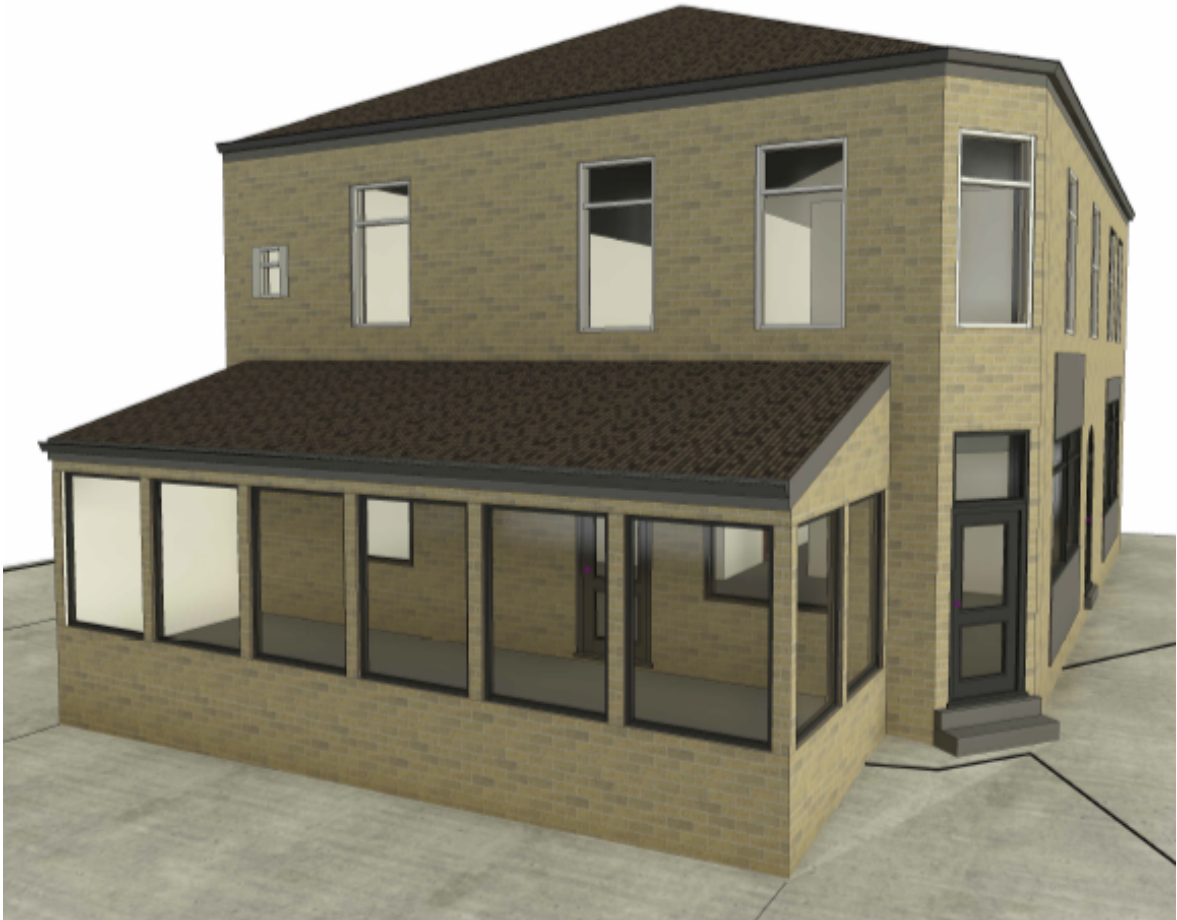
3.4 Above: Image of proposed sympathetic extension.