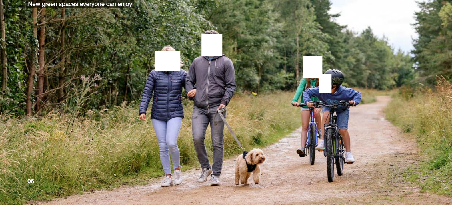
New green spaces everyone can enjoy

We believe that the communities that host our projects should share in the benefits. The Shepley development would bring a wide range of social, economic and environmental benefits.