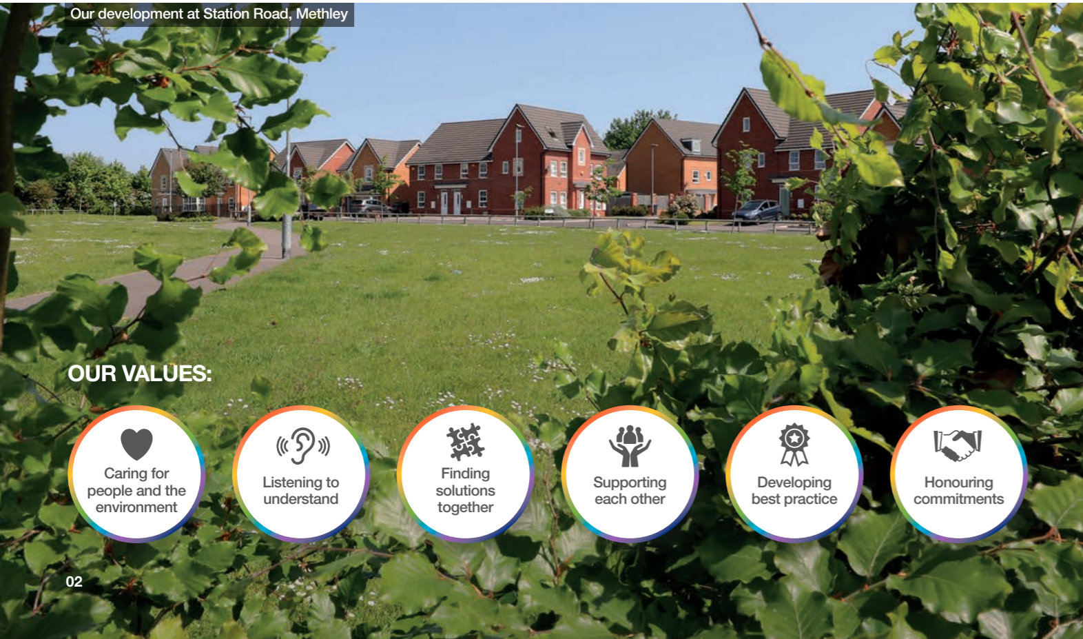
Our development at Station Road, Methley