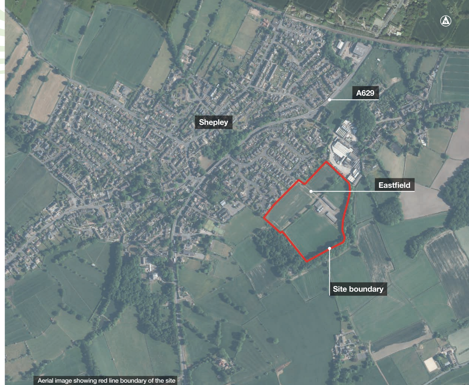
Aerial image showing red line boundary of the site