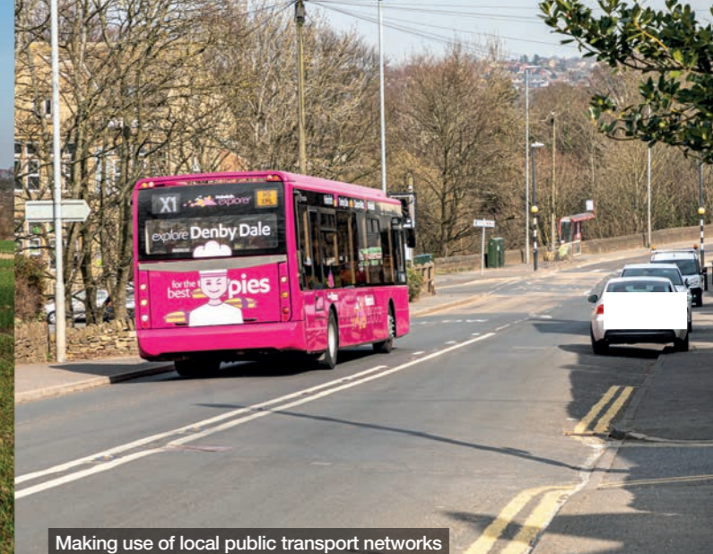
Making use of local public transport networks