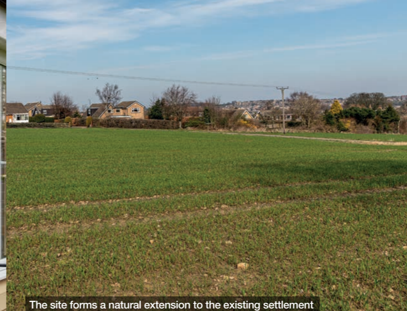
The site forms a natural extension to the existing settlement