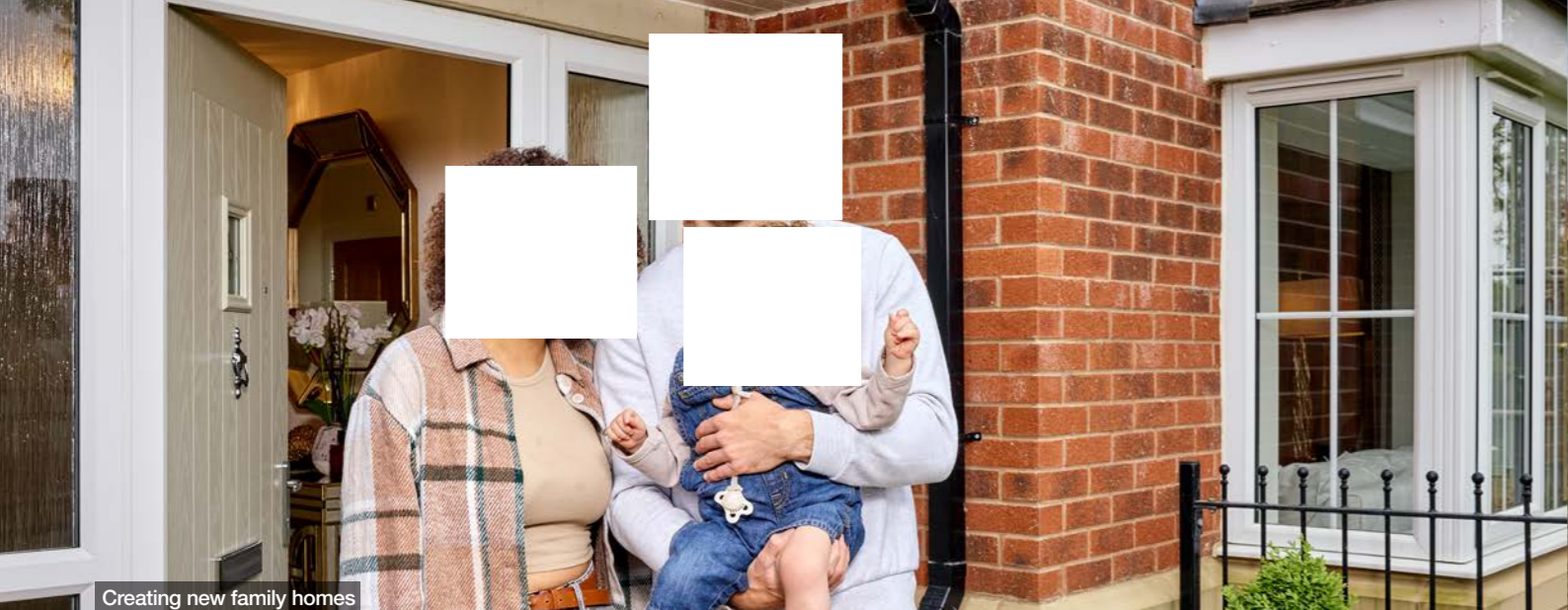
Creating new family homes