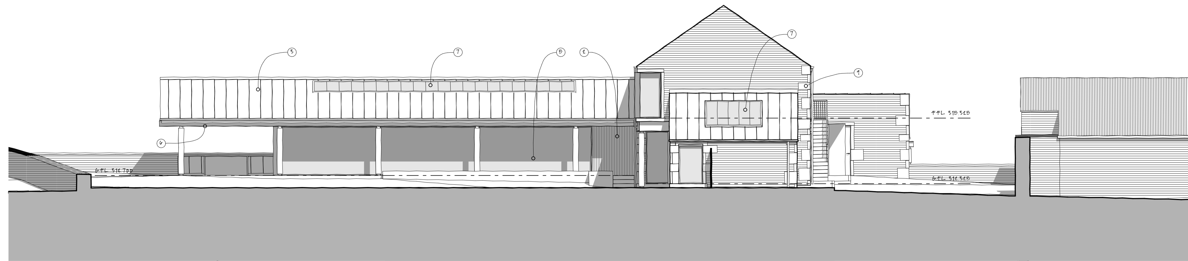
North Elevation - 1:100