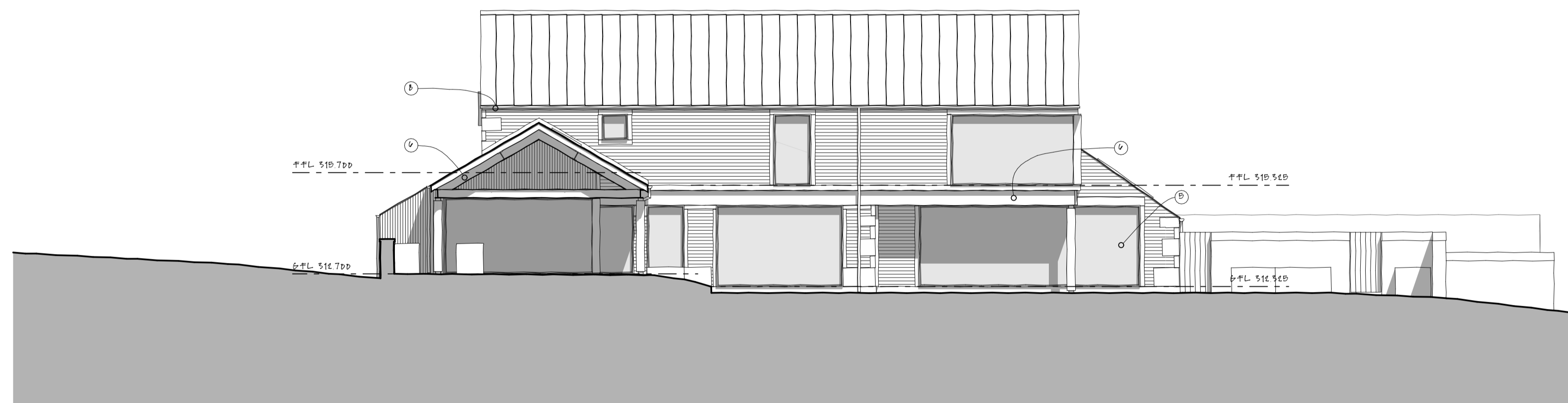
East Elevation - 1:100