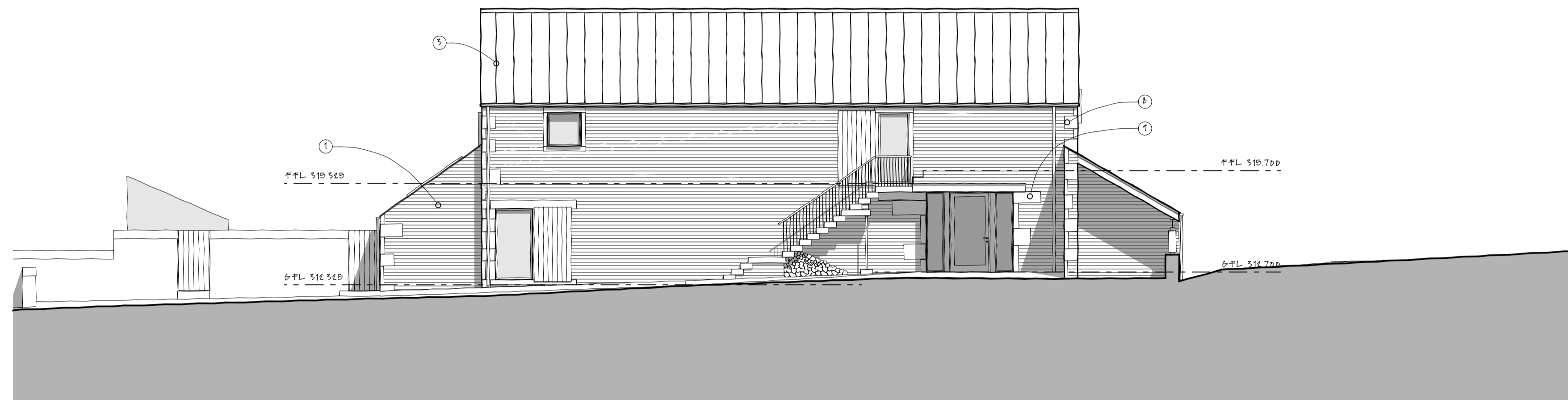
West Elevation - 1:100