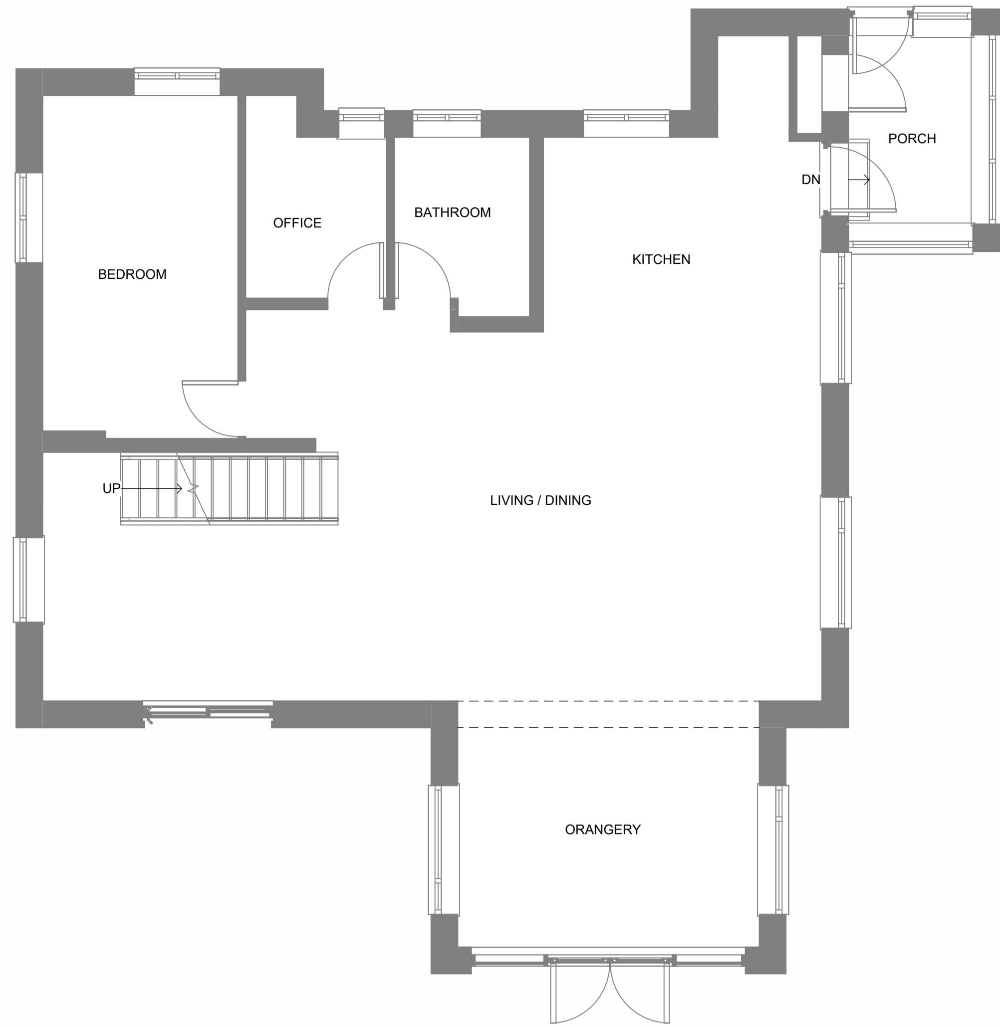
1 Proposed Ground Floor Plan 1 : 50