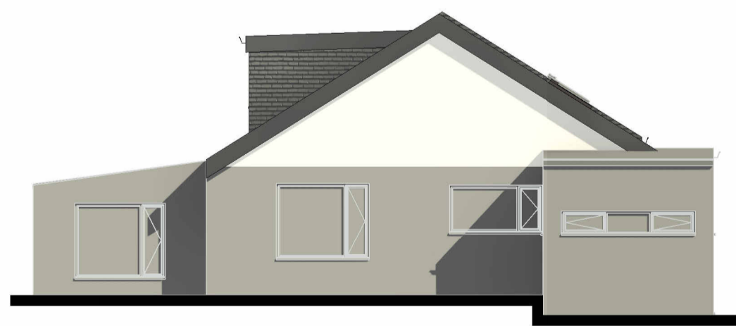
3 Proposed South Elevation 1 : 100