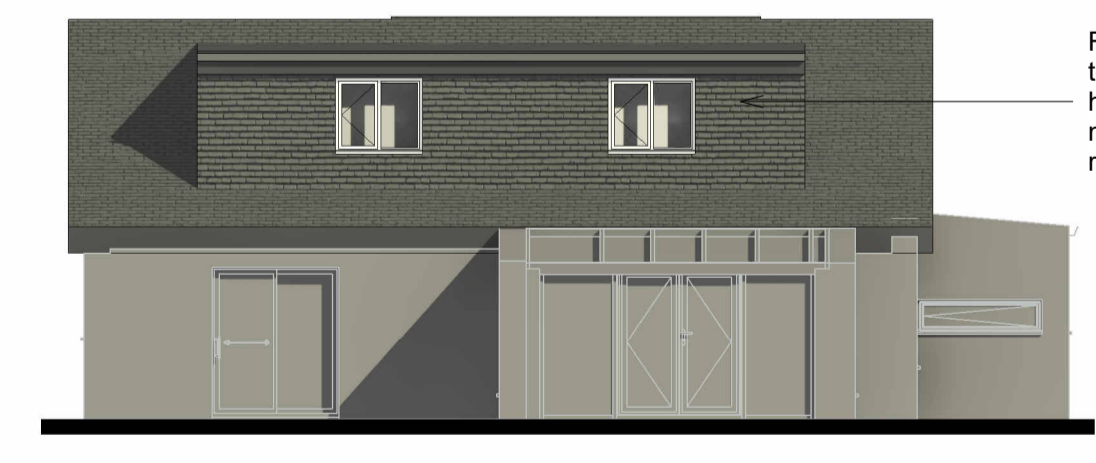
6 Proposed West Elevation 1 : 100