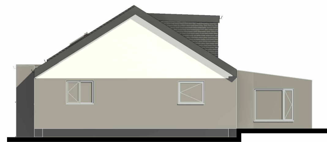
4 Proposed North Elevation 1 : 100