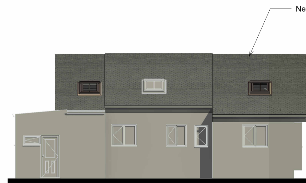
5 Proposed East Elevation 1 : 100