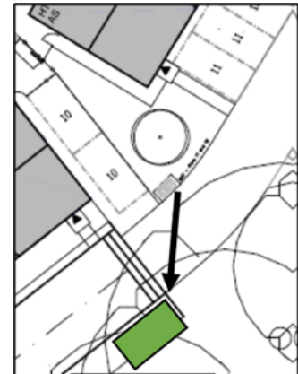
Plots 11 and 12