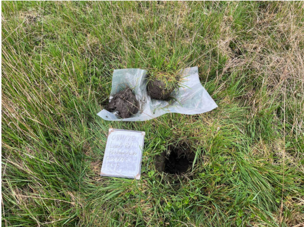
Photograph 9: Topsoil sample TS5.