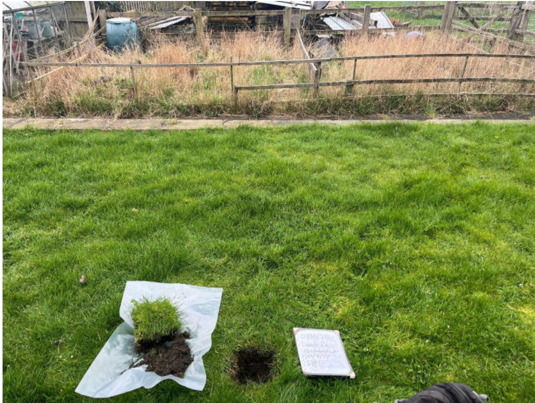
Photograph 1: Hand pit HP1.