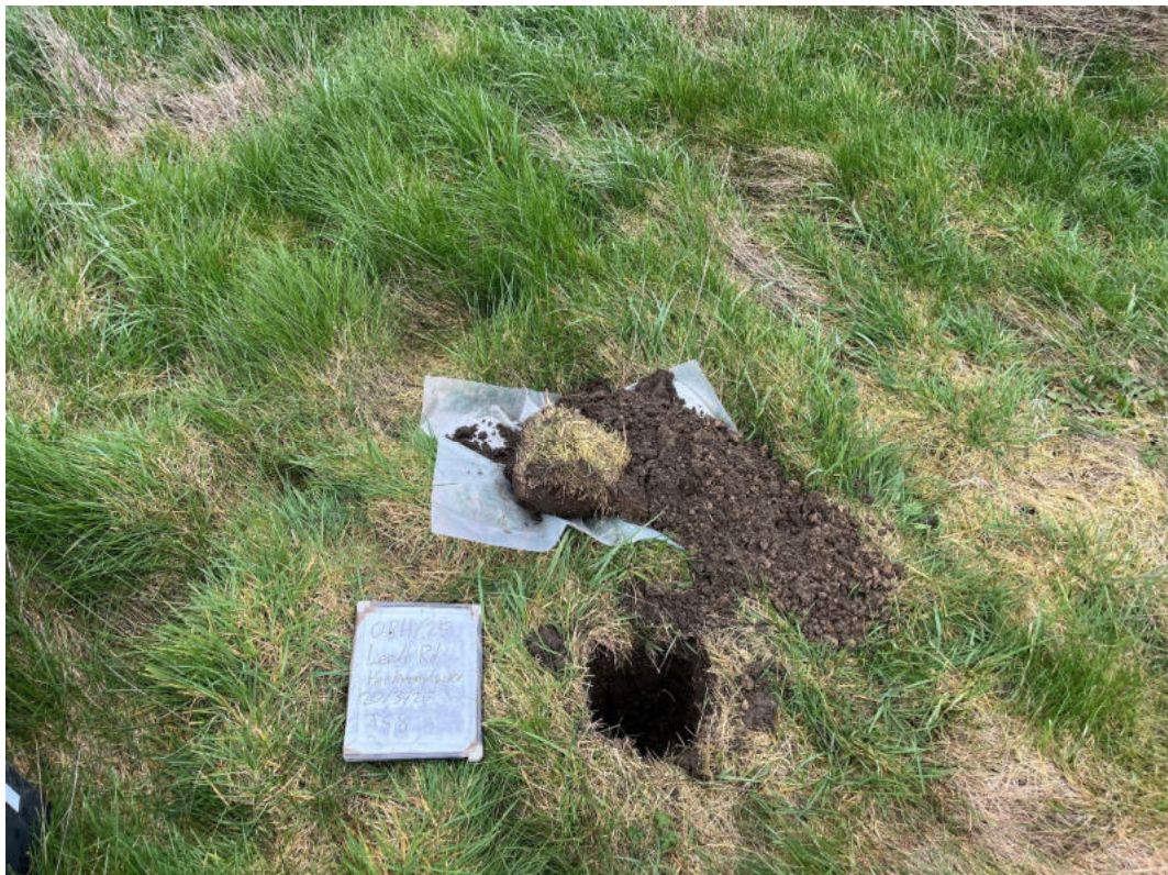
Photograph 12: Topsoil sample TS8.