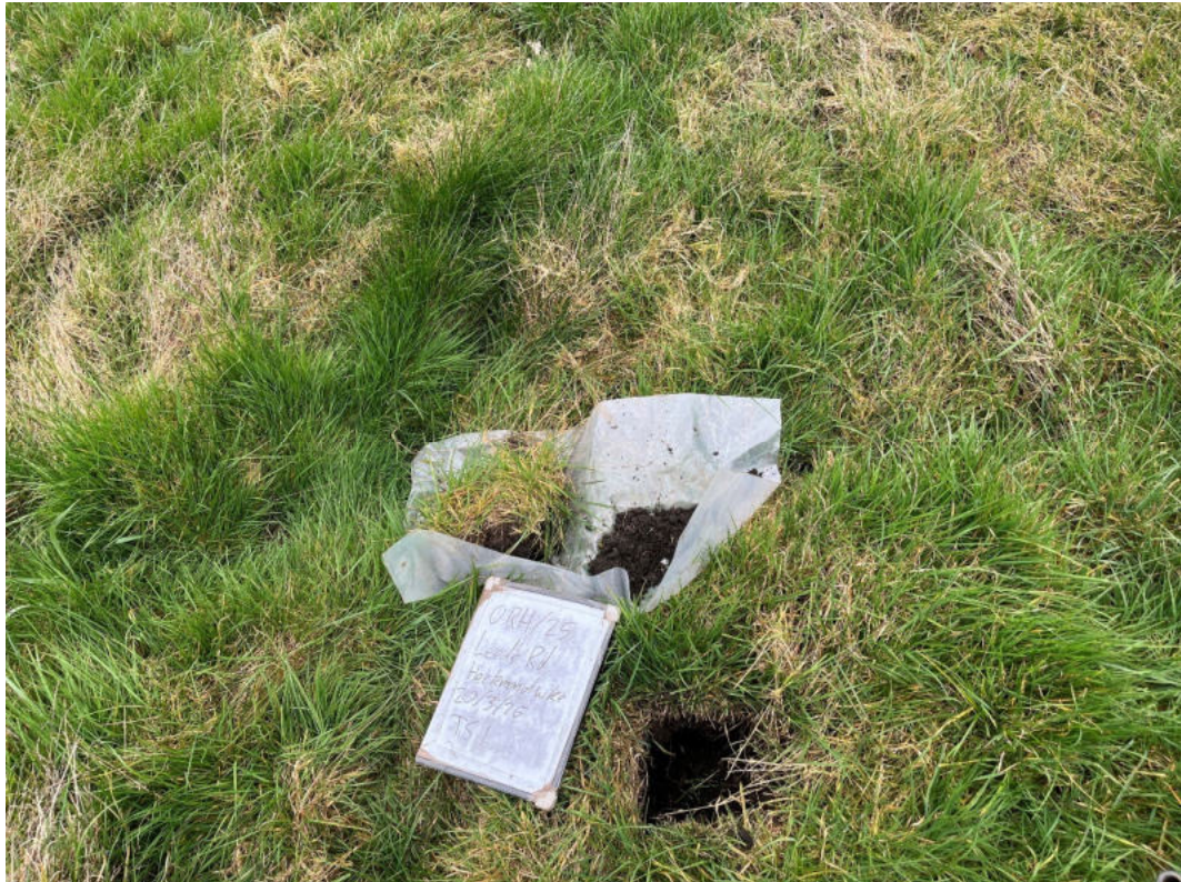
Photograph 5: Topsoil sample TS1.