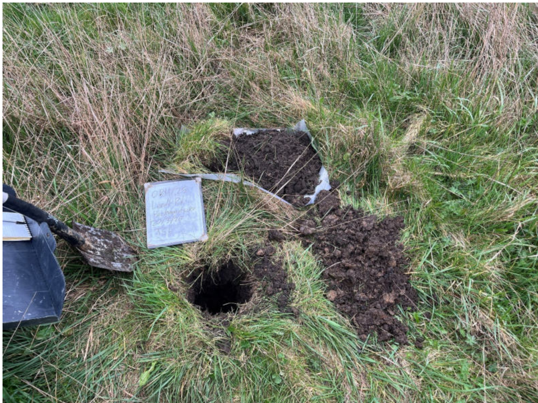
Photograph 10: Topsoil sample TS6.