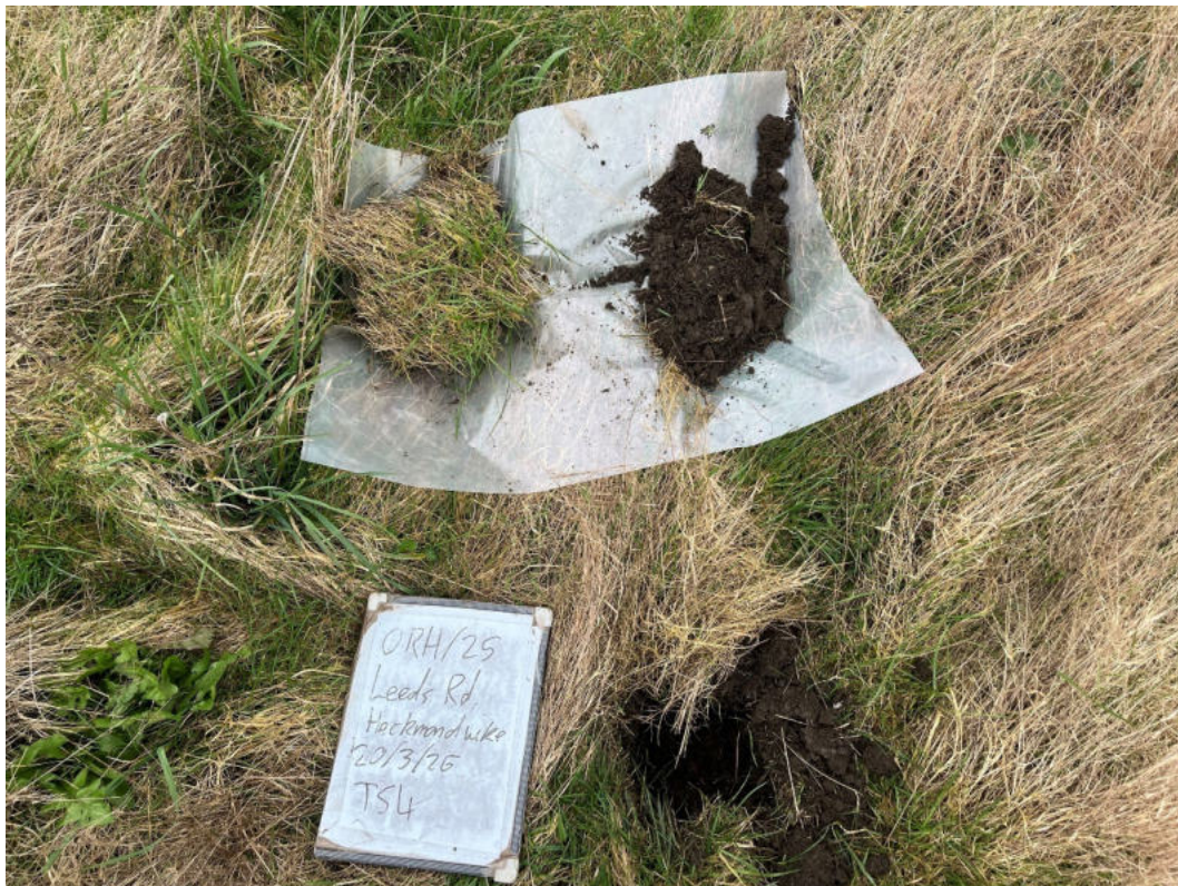
Photograph 8: Topsoil sample TS4.