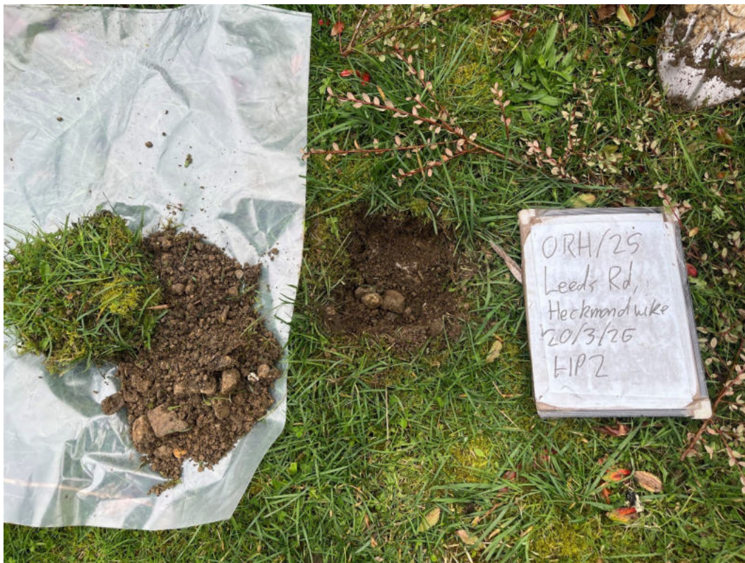
Photograph 2: Hand pit HP2.