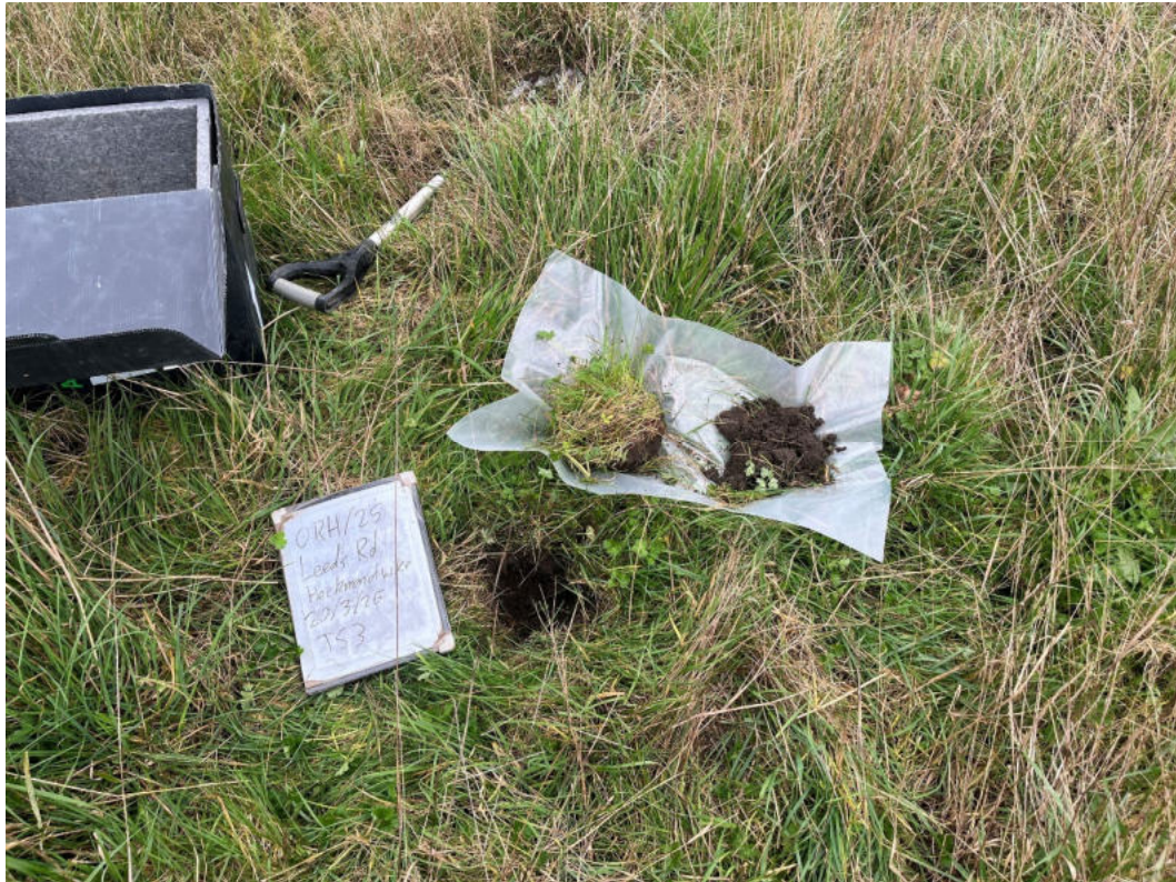
Photograph 7: Topsoil sample TS3.