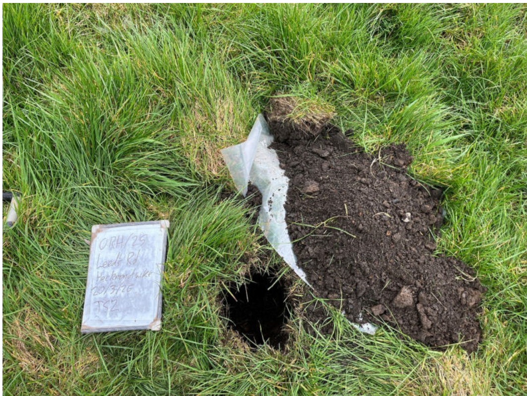
Photograph 6: Topsoil sample TS2.