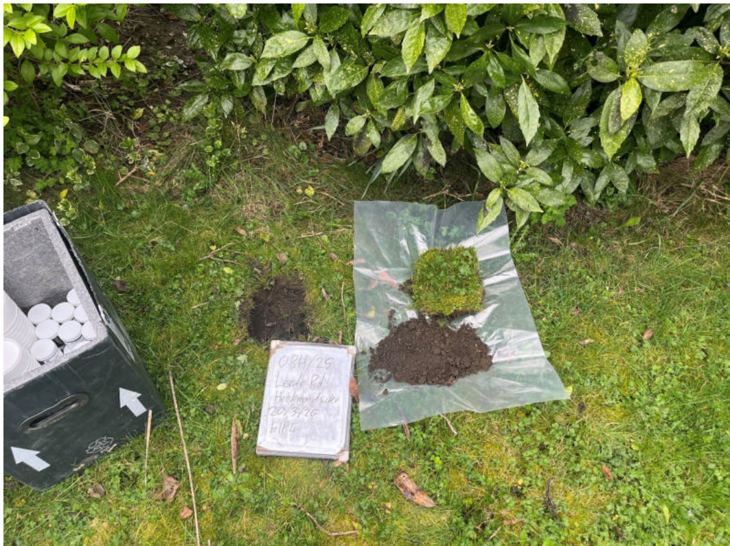
Photograph 4: Hand pit HP4.