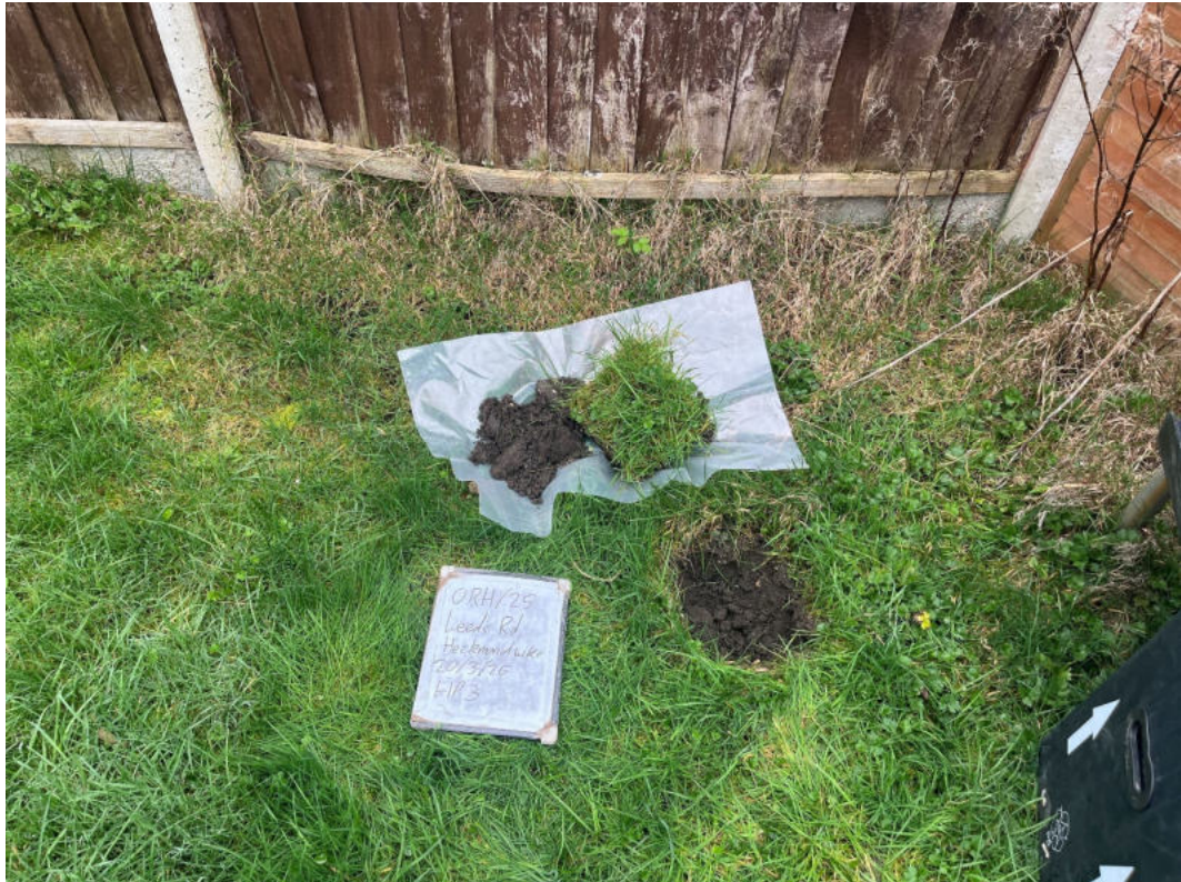
Photograph 3: Hand pit HP3.