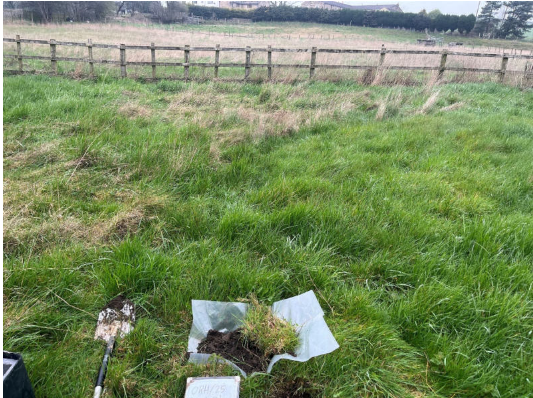
Photograph 11: Topsoil sample TS7.