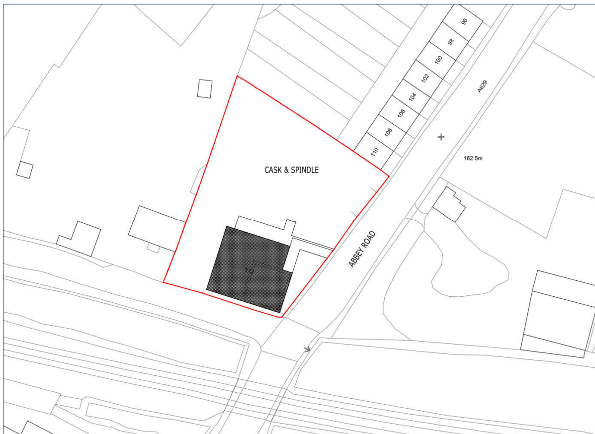
Figure 1.1: Development Site Boundary

The site is bounded to the north and west by residential dwellings. To the east, the site is bounded by Abbey Road. To the south, the site is bounded by Station Lane, with an elevated railway beyond.