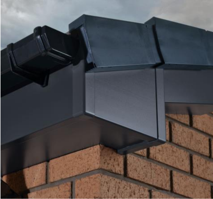
Upvc black soffits.