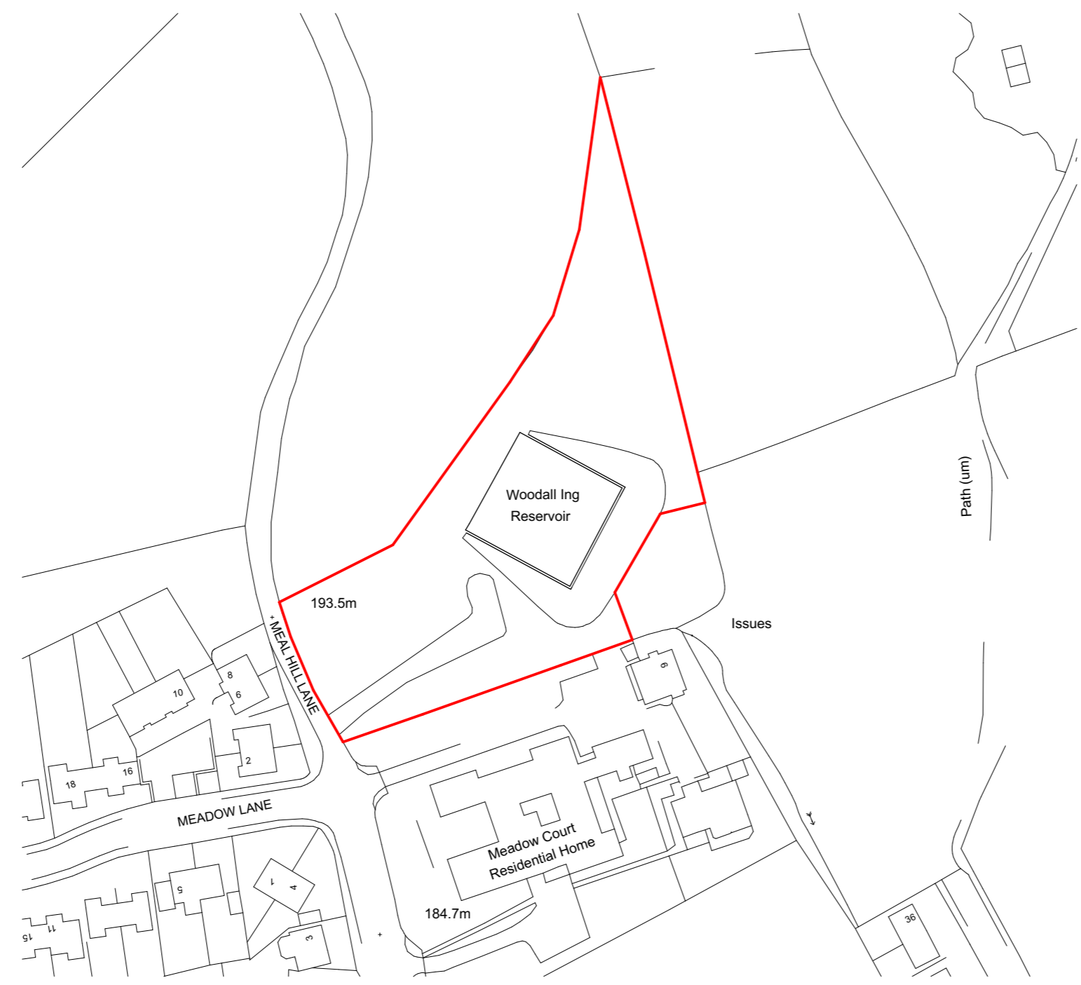
OS Location Plan 1:1250