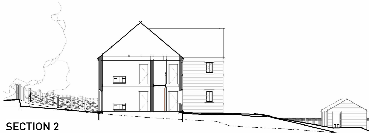
SECTION 2 1 : 200