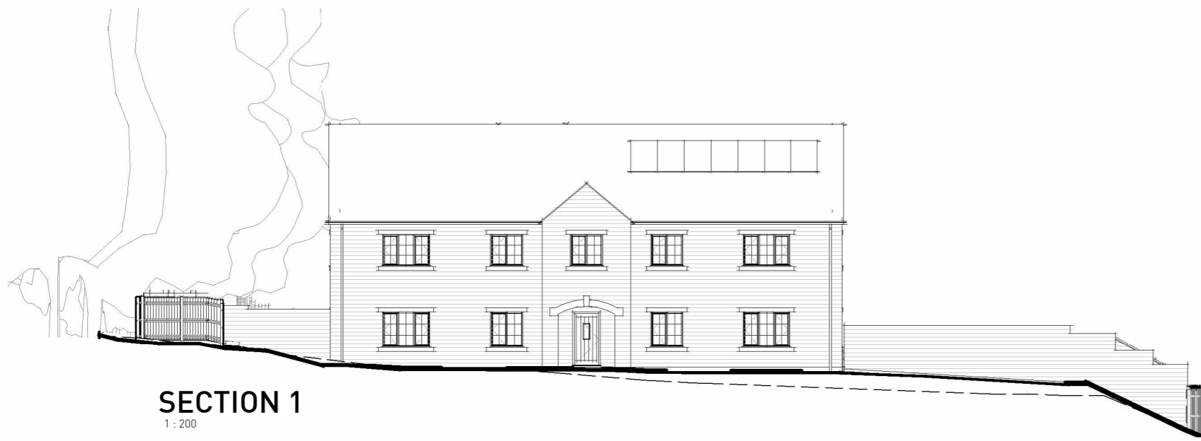
SECTION 1 1 : 200