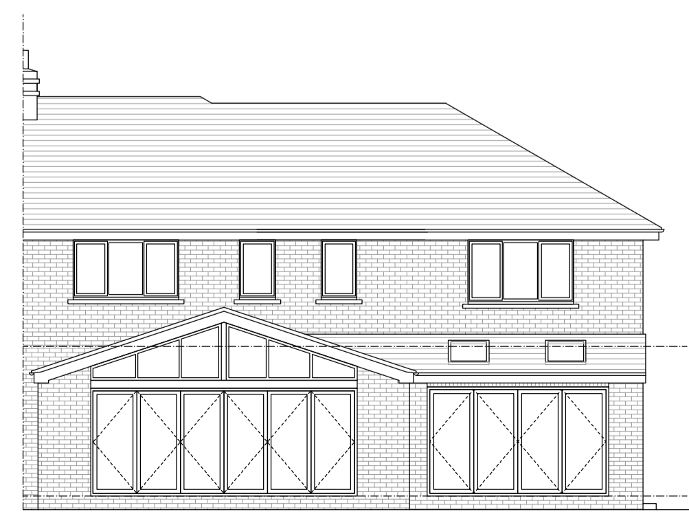
NORTH WEST ELEVATION ELEVATIONS 1:100