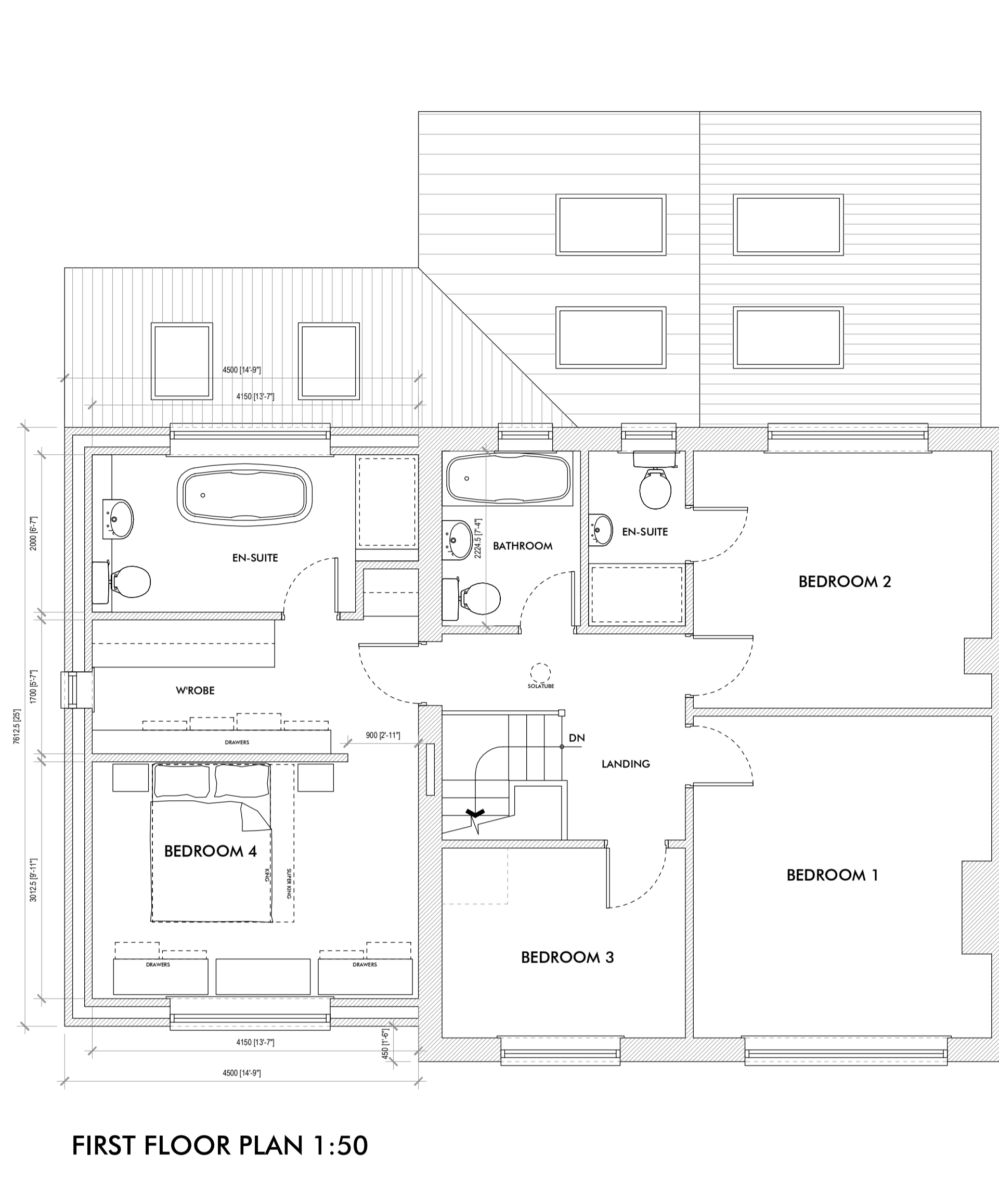
FIRST FLOOR PLAN 1:50