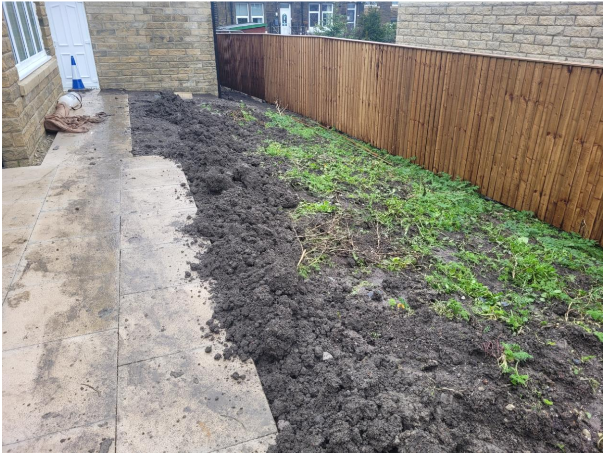
Plate 3 – Completed garden area to Plot 18