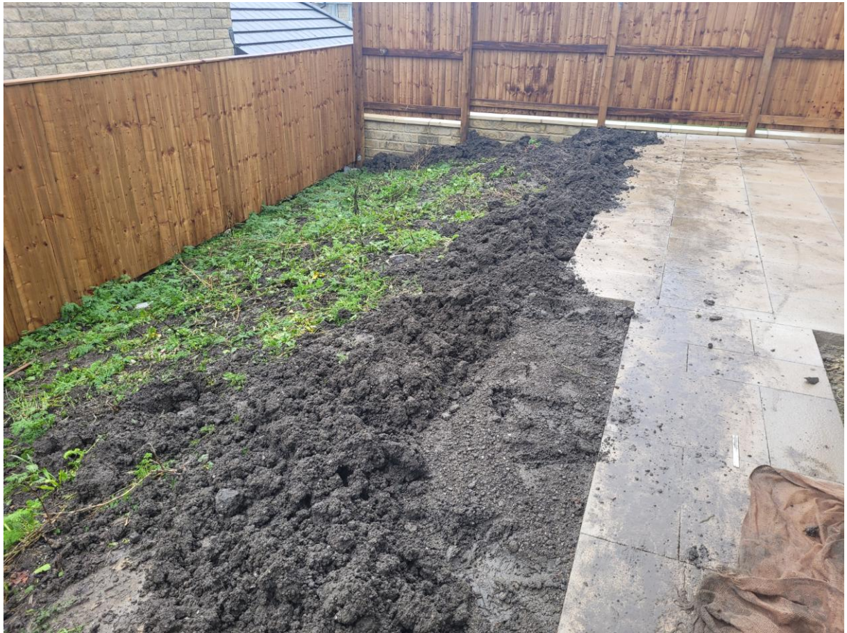
Plate 2 – Completed garden area to Plot 18