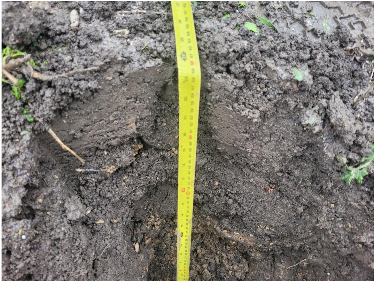
Plate 1 – Inspection pit to Plot 18