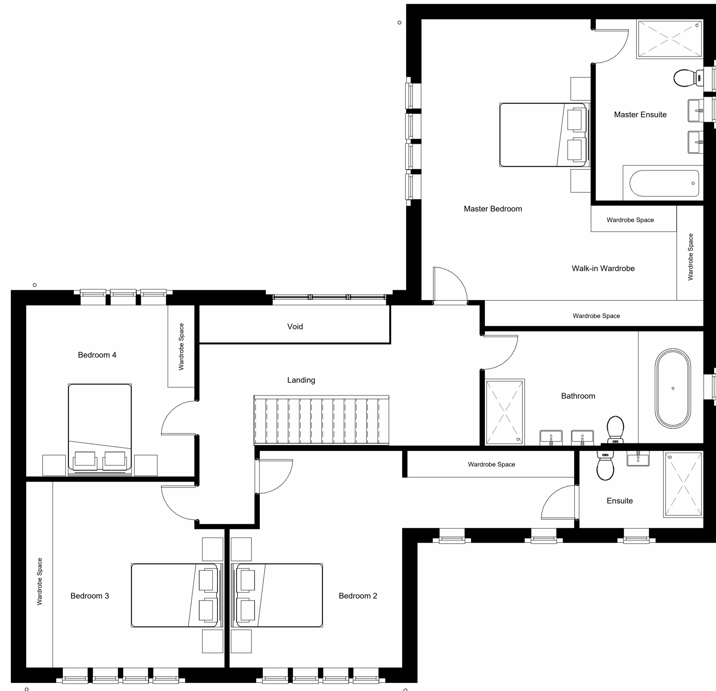
PLOT 2 FIRST FLOOR 1 : 50