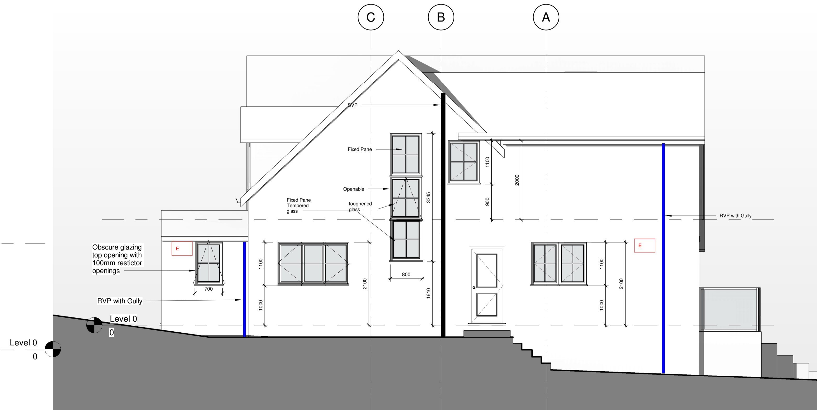
1 Side Elevation South 1 : 50

Location Plan North Point The contractor must verify all dimensions on site before commencing any work or fabrication drawings. If this drawing exceeds the quantities taken in any way Unite Designs are to be informed before the work is initiated. Only figured dimensions are to be taken from this drawing. Do not scale off this drawing. Drawings are based on Ordnance Survey and / or existing record drawings - design and drawing content is subject to detailed Site Survey, Structural Survey, Site Investigations, Planning and Statutory Requirements and Approvals. Authorised reproduction from Ordnance Survey Map with permission of the Controller of Her Majesty's Stationery Office Crown Copyright reserved. Unite Designs Copyright.