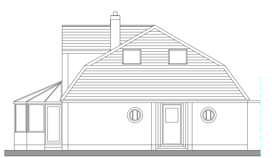
PART SOUTH EAST ELEVATION