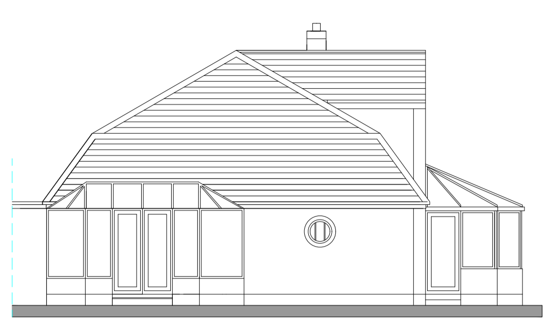
PART NORTH WEST ELEVATION