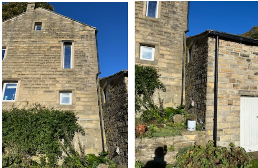
View of Southeast elevation and location of the proposed new timber deck. The window to the bottom right is the proposed window to be enlarged into a door opening.

The site is located within the shared grounds of a former farm called New Hagg Farm. The original house is grade II listed and during the 1970s was converted into three houses. The Barn was converted into a house in 1990. The Barn is located to the rear of the main house on a sloping south facing site.