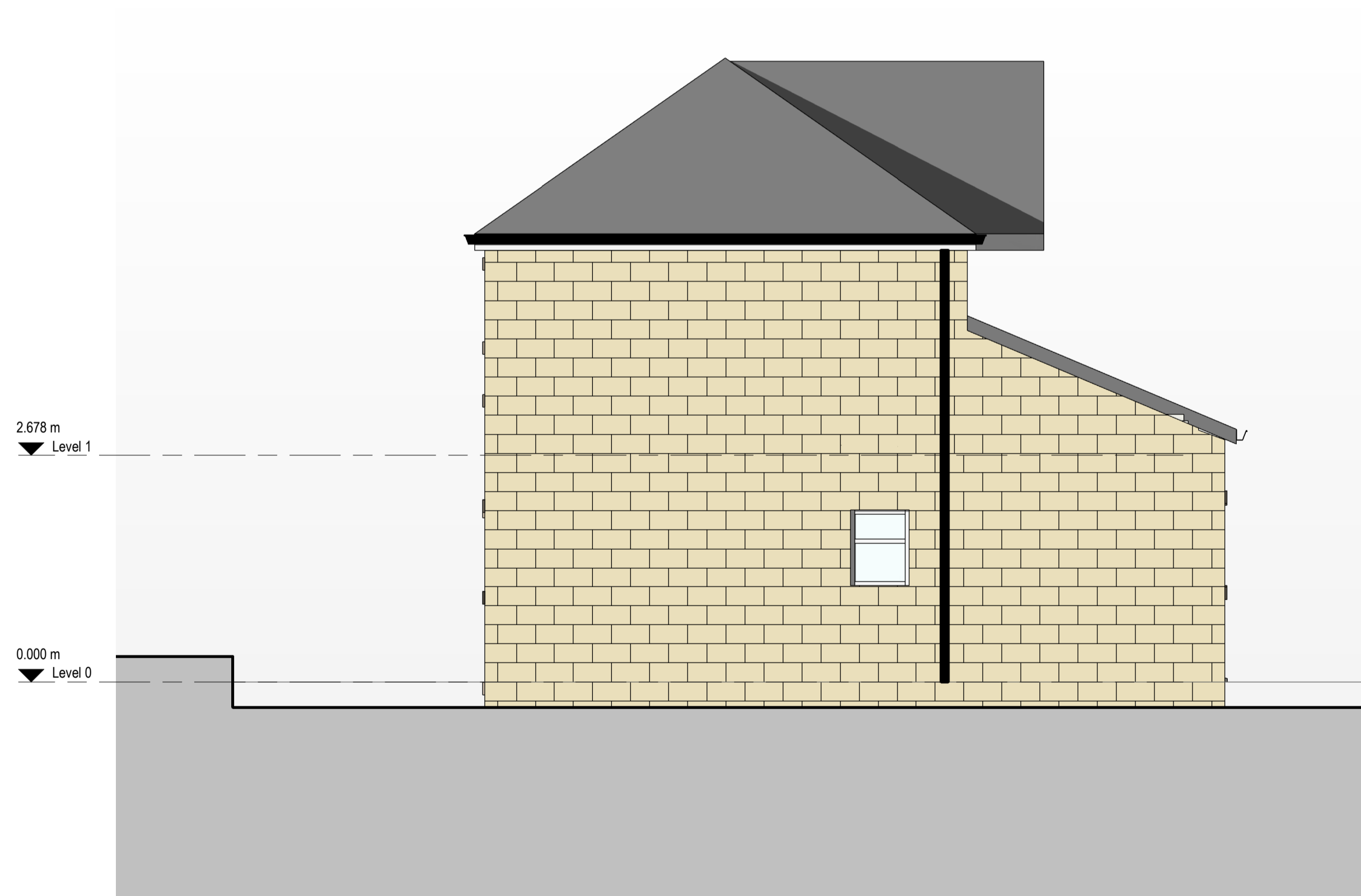
1 Side Elevation 1 : 50